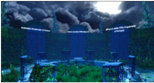
Fig. 1. A node of the labyrinth.

is not aimed at reconstructing a real environment: rather, the virtual environment is employed a tool to convey the semantic relations over a set of cultural objects through a visual layout.