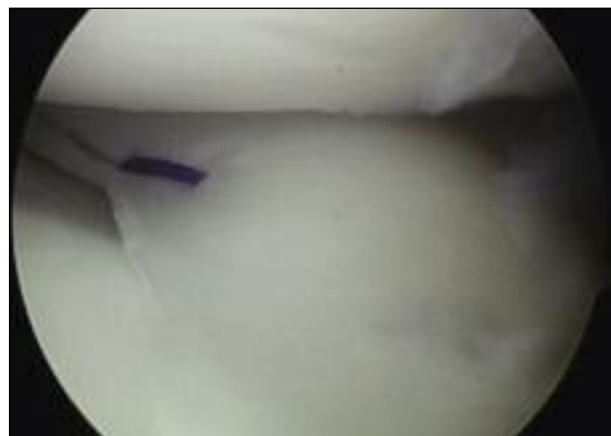
Fig. 4. Arthroscopic view of meniscal repair of the medial meniscus posterior horn.

Melton et al. (36) studied the long-term outcome of patients submitted to meniscal repair associated with ACL reconstruction. They excluded patients with pre-