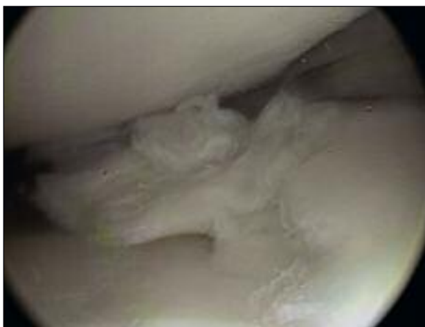
Fig. 2. Arthroscopic view of a medial meniscus posterior horn tear.

The medial meniscus plays an important role both in knee stability and in spreading loads (29). Meniscal tears are often irreparable and they are commonly located in the posterior horn ( Figs. 2, 3 ); they are generally treated with a partial meniscectomy (30). Total meniscectomy has been shown to increase AP instability of the knee (11). For this reason, surgeons prefer partial meniscectomy which gives better results with, overall, fewer stability-related complications (31). In addition, fewer radiographic changes and less joint space narrowing were demonstrated with partial