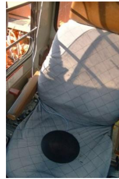
Figure 1 Semi rigid disk positioned on the surface of the operator seat for the WBV acquisition

WBV accelerations were measured in the same month of May 2015 along the three mutually perpendicular directions (X, longitudinal; Y transverse; Z, vertical) on the surface of the operator's seat (Figure 1), accordingly to the ISO 2631-1. A semi-rigid disc, incorporating three mutually-perpendicular piezoelectric accelerometers (ICP ® , Integrate Current Preamplifier, from PCB, type 356B41 with sensitivity of 100 mV/g, frequency range \pm 5\% from 0.5 to 1000 Hz), was positioned on the seat cushion of the driver.