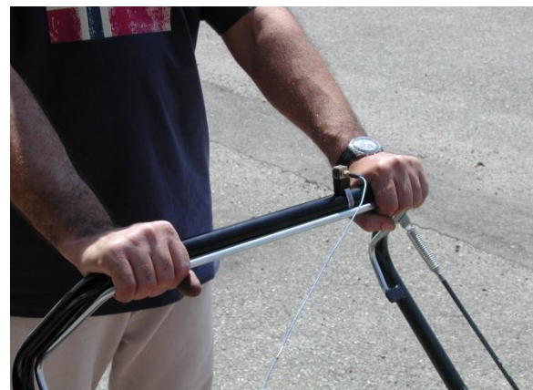
Figure 2 Accelerometers fastened to the handlebar of the mower for vibration data acquisition

HAV accelerations were measured accordingly to the EN ISO 20643: 2008 standard: one or two (in function of the machine type) tri-axial accelerometers ICP by PCB (SEN020 model, 1 mV/g sensitivity, 10 g mass). All the measurement chains were calibrated with the reference source B&K 4294 calibrator before and after the measuring cycle. For the vibration measurements a LD HVM100, connected to the accelerometers, was used. The entire measurement chain and the calibrator was verified at the Calibration Centre LAT No. 002 on 2014/11/22.