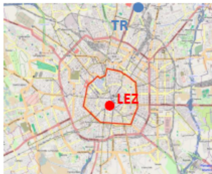
Fig.1 PM sampling at the traffic site (TR) and the limited traffic site (LEZ) in Milan.

The chemical composition of PM (collected on quartz fibre filters, 11.0 cm Ø) was analysed in detail including: the carbonaceous fraction (organic carbon, OC, and elemental carbon, EC), inorganic ions, elements, and trace organic compounds, including carboxylic acids, alkylamines, polycyclic aromatic hydrocarbons (PAHs) and alkanes. The OP of PM was assessed by two different chemical assays (a-cellular methods): the dithiothreitol (DTT) assay (which measures the consumption of DTT due to the ability of redox active compounds to transfer an electron from DTT to oxygen); the 2,7 dichlorofluorescein (DCFH) assay (a measure of equivalent H 2 O 2 concentration of reactive oxygen species in the PM samples by oxidising DCFH to fluorescent DCF).