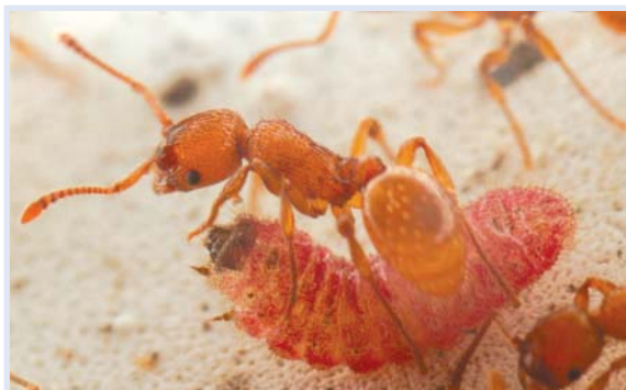
Figure 1. A worker Myrmica scabrinodis in its nest feeds a larva of the butterfly species Maculinea alcon .

In addition to analyzing the similarity of the sounds emitted by Maculinea and Myrmica , we observed the behavior of the ants to better understand the role of acoustical emissions in the ant–butterfly relationship. Not surprisingly, playback experiments