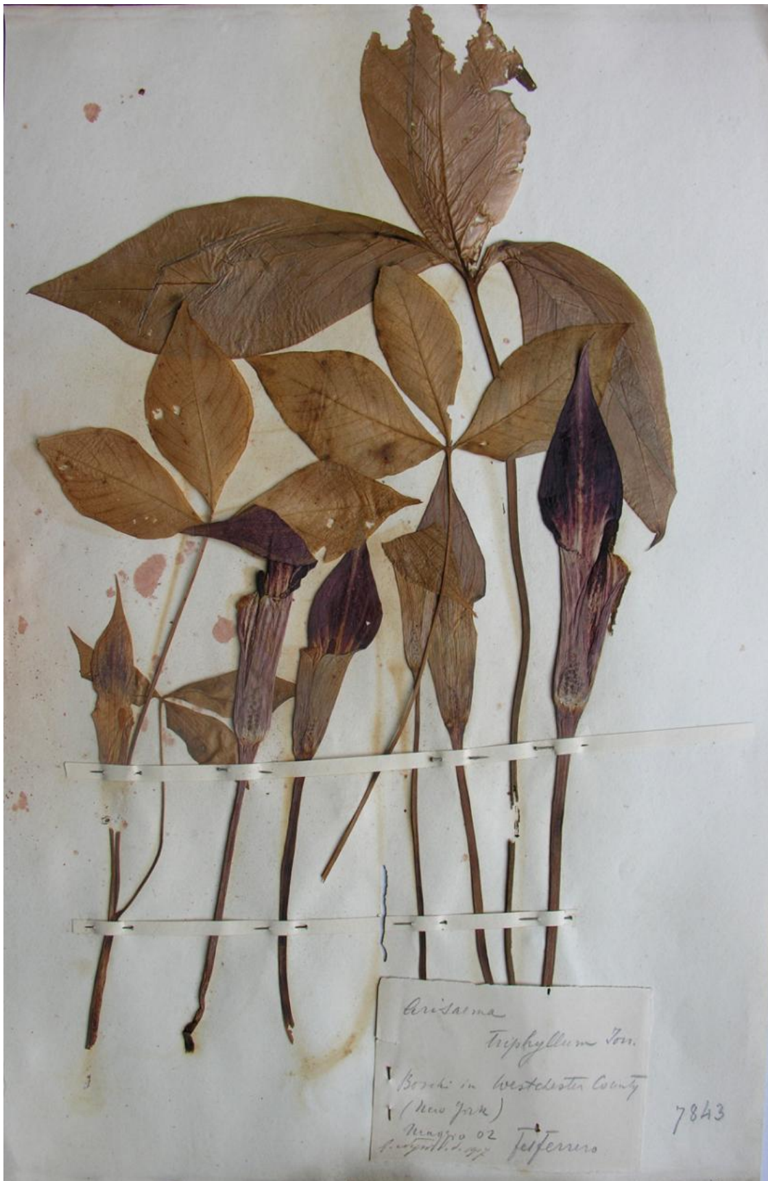
Figure 4. North American herbarium specimen of Arisaema triphyllum conserved in TO, collected by Felice Ferrero (02/05/1907).