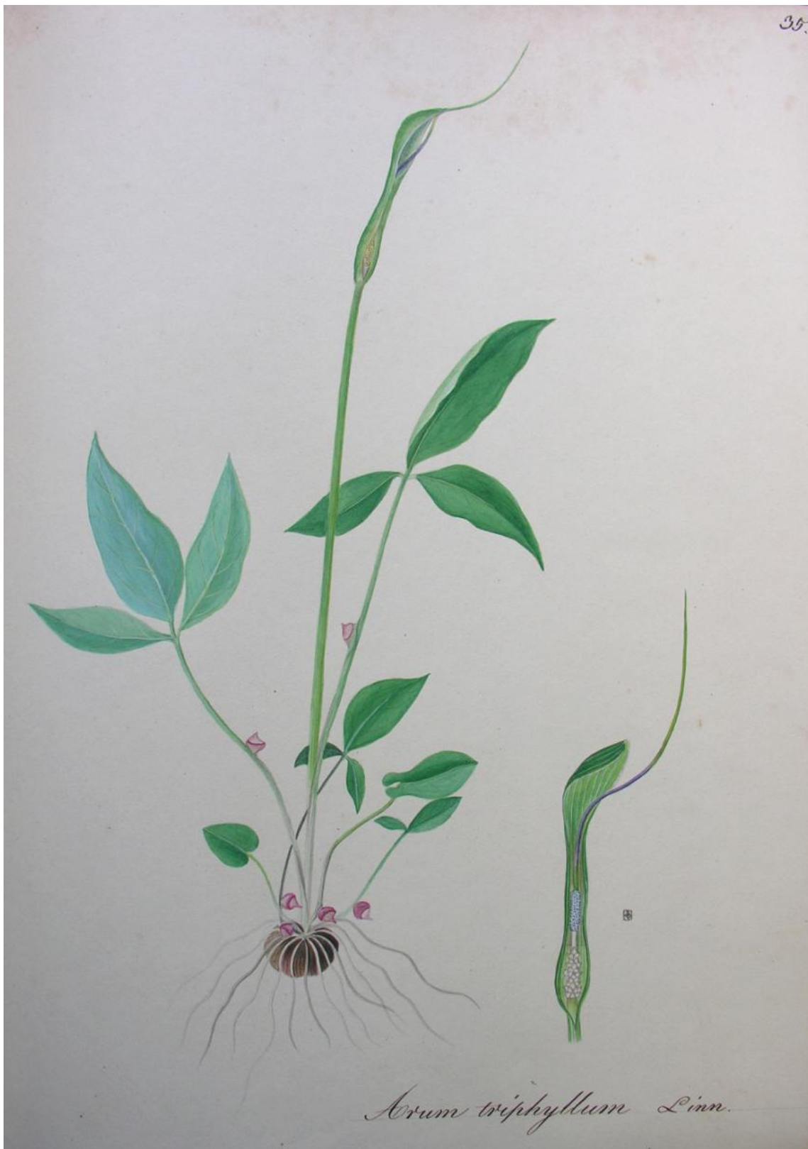
Figure 3. Illustrated plate of Pinellia ternata (sub Arum triphyllum ) from Iconographia Taurinensis (t35, vol. 55) conserved in the Library of Department of Life Sciences and Systems Biology (University of Turin).