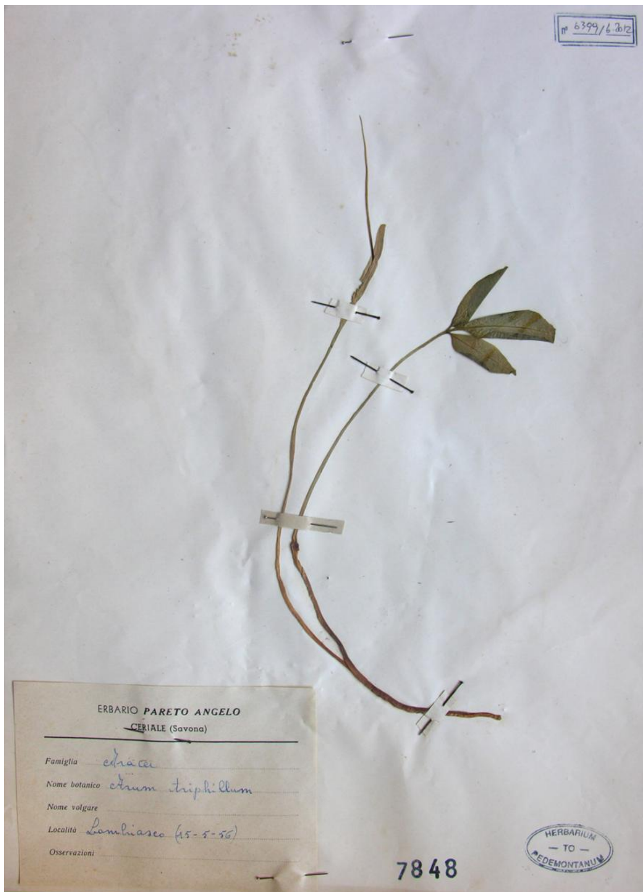
Figure 5. Herbarium specimen of Pinellia ternata (sub Arum triphyllum ) newly acquired in TO, collected in 1956 by A. Pareto near the River Po at Lombriasco (Province of Turin).