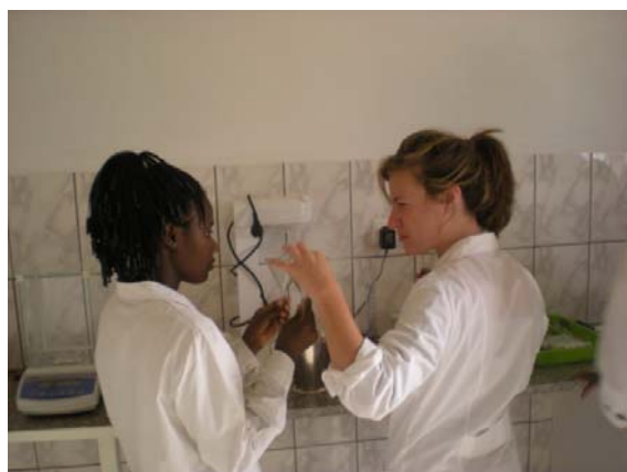
Fig. 4 - Angola, Funda, A.M.E.N. Medical Center.