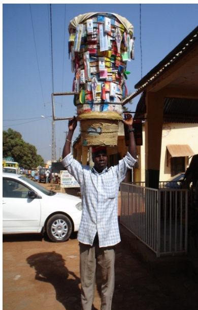
Fig. 1 - Cameroun, street pharmacist.