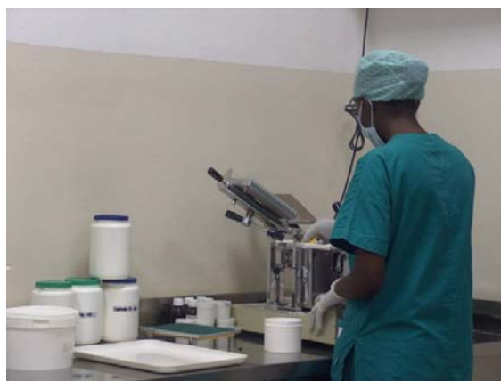
Fig. 5 - Cameroun, Garoua, «Notre Dame des Apôtres Hospital».