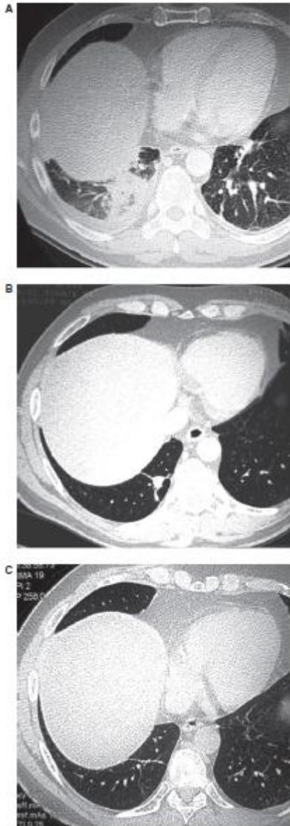
Figure 1. High-resolution computed tomography scans of the lungs: nodular opacity with halo sign in the right lung with plural effusion at 1 month post transplant (A); disappearance of the ground-glass halo sign and major reduction in the nodular opacity at 2 months post transplant (B); complete resolution of the lung infiltrate at 12 months post transplant (C).

However, after 3 days of incubation at 37°C on Sabouraud dextrose agar, blood cultures drawn on day +8 from the basilic CVC and from a peripheral vein yielded a filamentous fungus (Fig. 2A). Initially, white colonies became wooly and yellow-green within a week. At first, microscopic examination showed septate hyaline hyphae and, after a few days, conidiophores, phialides, and conidia were observed. Conidiophores were hyaline, branched with a pyramidal arrangement, and phyalide were hyaline, flask-shaped, and producing round, smooth green conidia. The fungus was identified as Trichoderma species by colony aspect on Sabouraud dextrose agar and by morphological features of the conidia and phialides.