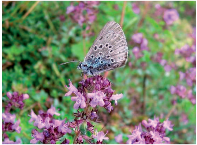
FIG 3. — Maculinea arion (Linnaeus, 1758).