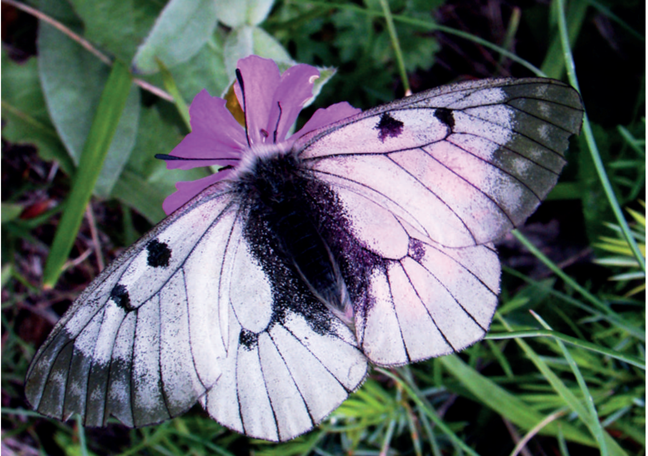
FIG 2. — Parnassius mnemosyne (Linnaeus, 1758).

L. sinapis populations” have been recorded, but no molecular data are currently available for the Valdieri area. However, L. juvernica is known to occur at least in NE Italy, at the Val di Tovo lakes (Dincă et al. 2011, 2013).