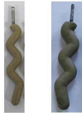
Figure 2 The two coated teeth (diameter: 14 mm left, 19 mm right)

The comb had five titanium undulating teeth (4 mm diameter), coated with silicone and driven by an electrical engine powered by a battery pack (12 VDC). During the tests the harvester was equipped with two series of undulating teeth with whole diameters of 14 mm and 19 mm (Figure 2). The coating elastic material was silicone with hardness value of 50 Shore A (EN ISO 868). The use of undulating teeth of different thicknesses did not change the inter-axis distance (2 cm), and a constant space was maintained between the contiguous undulating teeth. With the machine unloaded, the rotational teeth speed was 3,360 r/min and it was monitored by a mechanical tachometer (Deumo 2, Deuta-Werke, Bergisch Gladbach, Germany).