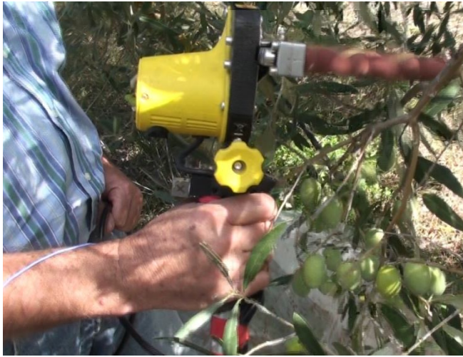
Figure 1 The electric comb machine at work

to a maximum height of 2.9 m could be mounted on, but in this work it was not used.