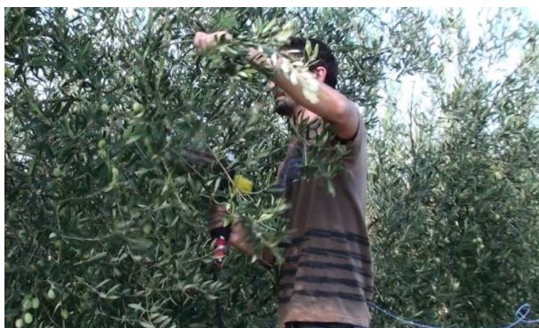
Figure 4 The branches combing to detach the olives

After holding the harvesting tree branch with the left hand and inserting the comb teeth inside the secondary branches, each operator 'combed' them downwards: if the drupes did not detach, the same combing operation was repeated. The arms position was sometimes over the shoulder, in function of the branches height.