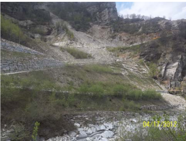
Figura 3.b: "Cava del Tiglio" Loc. Pra del Torno, in Rorà Village (TO), in this area it was used a "artificial loam" compared to natural soil and compost (at the bottom). (April 2012)

The latest experimentation was conducted in AFIB stone manufacturing company (Trino Vercellese); the sludge produced in the working plant came from granitic rocks (diamond frame saw sludge).