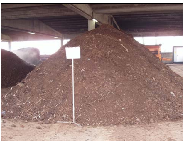
Figure 2: product—mix A – from bioremediation treatment (ACEA di Pinerolo plant)