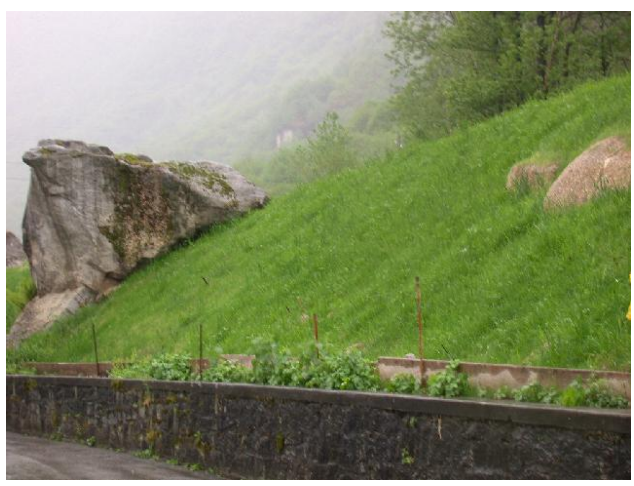
Figure 1: Loc. Loc. Lodrino (Canton Ticino), in this area it was used a "artificial loam" obtained from a bioremediation treatment, after some months from the seeding

The total (ca 150 m³) of the 4 mixes was used for quarry rehabilitation in Luserna Stone Basin: it was scattered, with an 8-10 cm thickness) in a hill side in "Cava del Tiglio" Loc. Pra del Torno, in Rorà Village (TO), see figure 3.a (DINO ET AL., 2006). It is evident that in the area on which was placed the obtained "loam", the vegetation appears to be very abundant and, thanks to the particle size, it guarantees the retention of considerable quantity of water, available during drought periods. At present time (April 2012, see fig. 3.b) it is possible to underline that, without any kind of maintenance, the quarry rehabilitation is still active and integrated with the surrounding scenery.