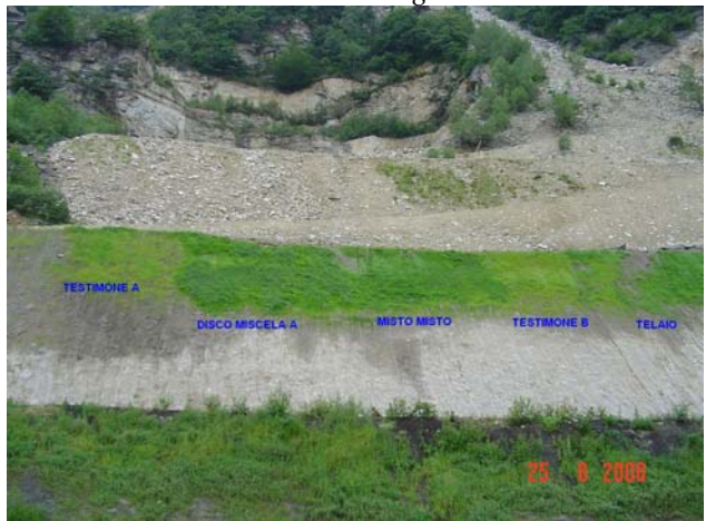
Figura 3.a: "Cava del Tiglio" Loc. Pra del Torno, in Rorà Village (TO), in this area it was used a "artificial loam" (mix A, C and D) compared to natural soil. The rehabilitation at the bottom is realized using only compost from ACEA (June 2008)