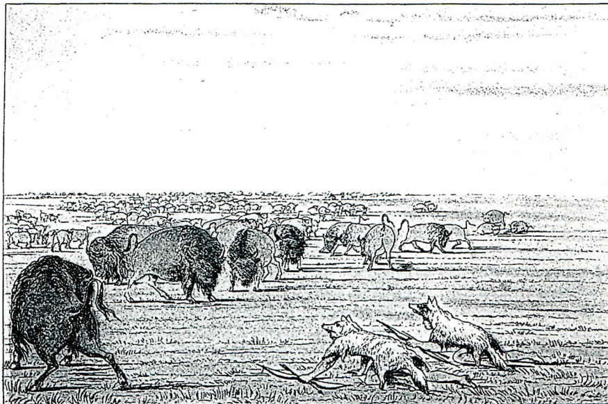
Fig. 1 Bison hunting on the Plains in wolf disguise. After George Catlin's Letters and Notes (London 1876), vol. 1, plate 110.

The ceremonial and ritual practices as well as the relationship between man and animals experienced in the vision quest indicate that the distinction between man and animals was not conceived of as a clear-cut separation. Plains people often employed "metaphorical extensions" between humans and animals, thus treating non-human species as if they were humans. Such a metaphorical use of animals in reference to human behavior was based on a cosmological conception in which the interdependency of all life forms, including man, played a pivotal role (Powers 1986:151–152).