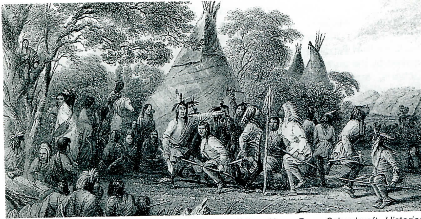
Fig. 3 Seth Eastman, "Dog Dance of the Dahcotas," from Henry Rowe Schoolcraft, Historical and Statistical Information (Philadelphia 1851-1857), 2: plate 22.

sault and fight against enemies for the exclusive benefit of the social group to which he belonged.