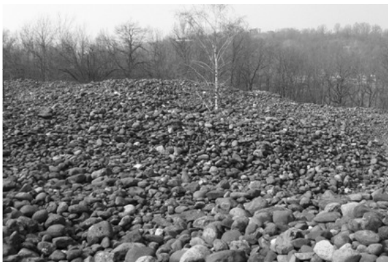
Fig. 2. Rounded cobbles and boulders accumulations on the Bessa aurifodinae upper terrace. Cumuli di ciottoli e di blocchi arrotondati sul terrazzo superiore delle Aurifodinae della Bessa.

Exploitations by artificial water-channel was carried out in contiguous but separate mining yards, everyone with a main deep evacuation channel (Bessa, Mazzè). This method produced two typology of reject deposits. Open-worked deposits of quite rounded cobbles and boulders (also erratic blocks), methodically accumulated in handmade piles 1-10 m thick on the terrace top in the site of the former placer (Fig. 2). Anthropogenic alluvial fans of clino-stratified clast-supported sandy-gravel with rounded pebble and cobbles, deposited downstream of the channel outlets on the lower alluvial plains surrounding the placer.