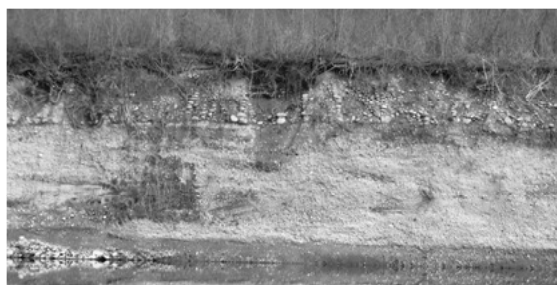
Fig. 3. Buried channel sidewalls outcrop at the top of a low terrace on the Dora Baltea River left scarp (Baraccone site, Villareggia). This anthropic horizon lies on Middle Pleistocene fluvial sandy gravel. Una successione di fianchi di canale sepolti affiora alla sommità di un basso terrazzo sulla scarpata sinistra del Fiume Dora Baltea (sito del Baraccone, Villareggia). Tale orizzonte antropico poggia su ghiaie sabbiose fluviali del Pleistocene medio.

The minor placers corresponding to monophasic proglacial fans were exploited by simple excavations without water channels, owing to their distance from any water resource. This mining activity, partially explainable as research workings, is testified by the presence of hectometric wide areas only partially covered with cobble small piles and riddled with some meters deep cone-shaped pits (Frascheia near Villareggia and Moncrivello, Areglio-Bose and Madonna della Cella near Borgo d'Ale, Ronchi between Baldissero and Torre Canavese and other minor sites). Only for the Bessa and Mazzè sites running water was employed, probably because the aqueduct building cost (2 km long for Bessa and at least 10 km for Mazzè) was remunerative according to the placer extension and its higher gold grade.