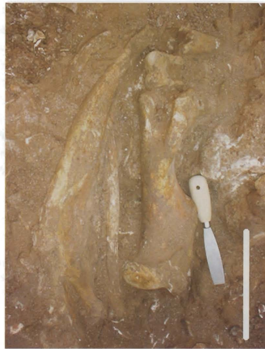
Fig. 2: Fossil bones of layer 7 (scale bar: 20 cm).

Cervids are represented by some isolated teeth and limb bones (layers 2–8); two large-sized first phalanxes recorded in level 7 can probably be ascribed to Megaloceros giganteus . Among carnivores, the occurrence of the wolf and the red fox is testified by some isolated teeth, occurring from layers 2 to 8, the lynx and the cave lion are recorded from layer 8 (some teeth and a talus respectively).