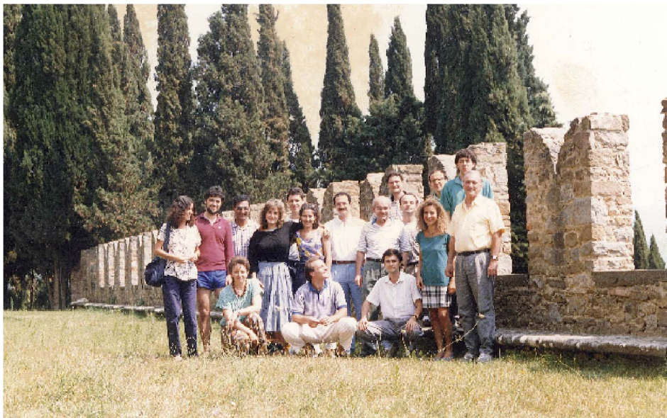
FIG. 2. Patrick Billingsley, standing in the far right, and Eugenio with some students in Cortona, Summer School, 1989.

the problem of estimating a statistical model by means of a mixture of Dirichlet processes. Such a problem was suggested by Diaconis and Ylvisaker (1985): with Slava we showed that it is possible to construct a mixture of laws of Dirichlet processes that approximates the distribution of any random probability measure, with respect to the topology of weak convergence. And we have been able to obtain, under suitable assumptions, the corresponding approximation bounds for the posterior measures. These results were presented at the 1st Workshop on Bayesian nonparametrics that took place in Belgirate (Italy) in 1997. While we were working on this paper, my mother became seriously ill and Slava has been very important in supporting me in such a difficult period.