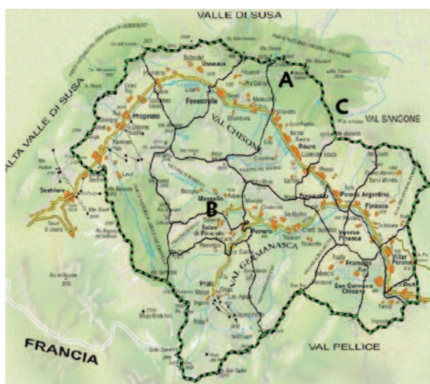
Figure 1. Study Area: Flock A Chisone Valley; Flock B Germanasca V.; Flock C Sangone V.

The study involved three sheep and goat livestock (flock), all affected in last years from attacks by wolves or stray dogs, located in three alpine valleys of the Turin Province: Chisone Valley (Flock A), Germanasca Valley (Flock B) and Sangone Valley (Flock C) (Figure 1).