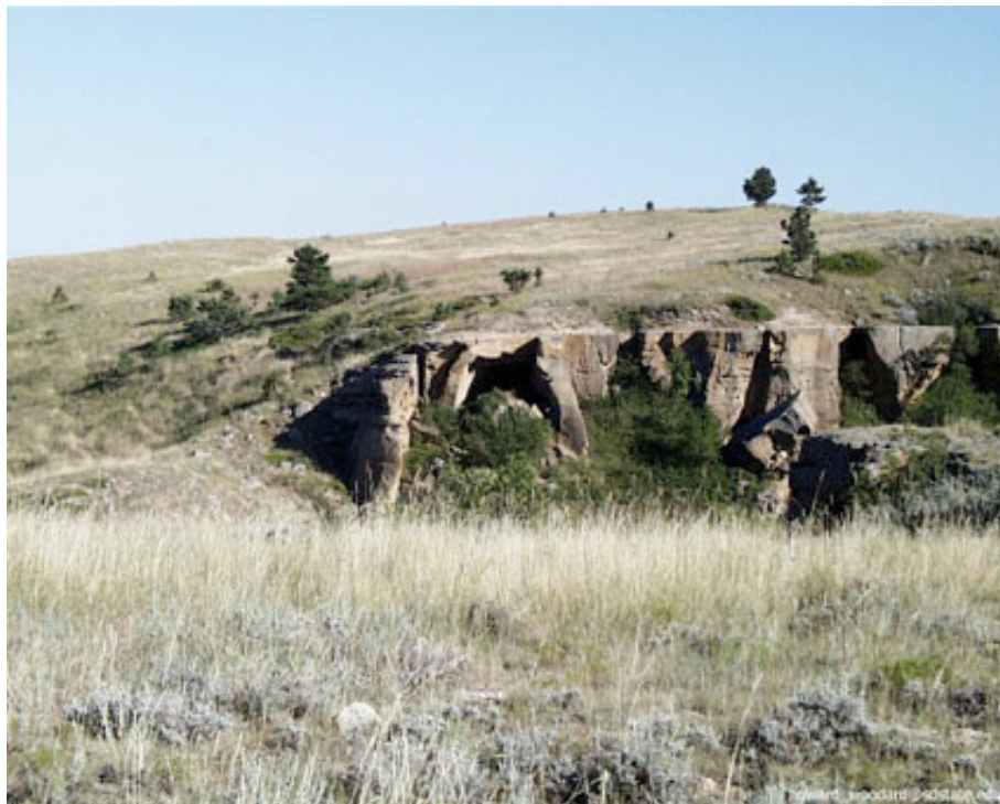
Fig. 4. Ludlow Cave, north of the Black Hills, South Dakota. The cave was reported to be a sacred sites for the Native peoples of the region and was related with mythological tales who explained that the buffalo went out from the underground world through the cave.

All Plains peoples conceived a sacred connection between the woman, who gives life, and the buffalo, which sustain life and give itself as food. This symbolic relationship was shown in the Lakota tradition of the White Buffalo Calf Woman ( Ptehincalasanwin ), a mythical being who brought to the people the Sacred Buffalo