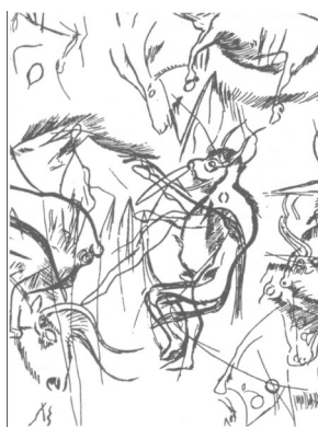
Fig. 2. Cave of Trois-Frères, Ariège : particular of the preceding scene: the buffalo man has something near the mouth, which has been interpreted as a musical instrument.

Although presenting a wide range of varieties in social organization and cultural details, the societies of the Great Plains of North America can be combined in a single Plains culture area, with a number of common elements based on a particular way of life. All Plains cultures were more or less dependent on the buffalo for subsistence and the animal was integrated into all aspects of life: the hides for making clothing, shelter, and containers; the horns and bones for tools, and so forth. The spirit of the animal was important too, as one of the fundamental aspects of religious life.