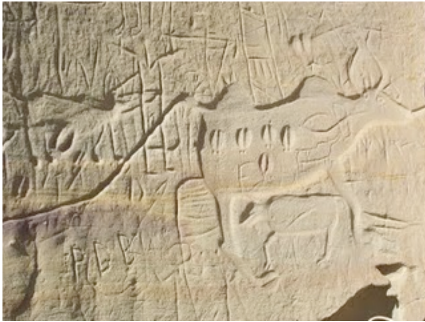
Fig. 3. Graved buffalo image, with hoof prints and female signs, from the Cave Hills area, South Dakota.