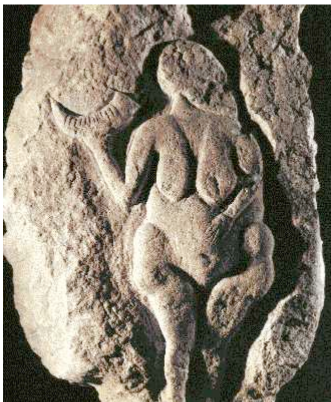
Fig. 5. Female figure with a bison horn in her hand, engraving from the Laussel Cave, Dordogne, attributed to the Gravettian Period.

Calf Pipe, the symbol of unity and prosperity of the nation. After having given the sacred object, the mysterious woman turned into a buffalo calf, of different colors, and disappeared from view, revealing her identification with the buffalo nation (Powers 1986). A similar meaning had the young woman given as wife to the Cheyenne hero inside the sacred mountain by the Old Man and Old Woman. The Wolf Man was Nonoma , the term for Thunder-spirit, and the Old Woman was Esceheman (Our Grandmother) the spirit of the deep earth. Both are the keepers of the animal spirits of the Plains. Ehyophstah (Yellow-haired Woman) is a buffalo spirit turned into a human to assist the Cheyenne. Her parents placed her in the position of master spirit of animals and therefore gave her the power to bring game. The sacred cave ( maheonox ) where the young woman was given to the people was Nowah'wus , Bear Butte. The giving of Ehyophstah established a kin relationship between the spirits ( maiyun ) and the Cheyenne and a kin relationship between the humans and the animals, under the tutelage of the spirits and Ehyophstah (Schlesier 1987). The sculpture on the wall of a rock shelter at Laussel (Dordogne), showing a woman with a bison horn in her hand (Clottes 2008: 74-75), could be interpreted as representing the relationship of humans with the animal world, in the image of a woman bringing to humankind the gift of life and fertility given by the animal people.