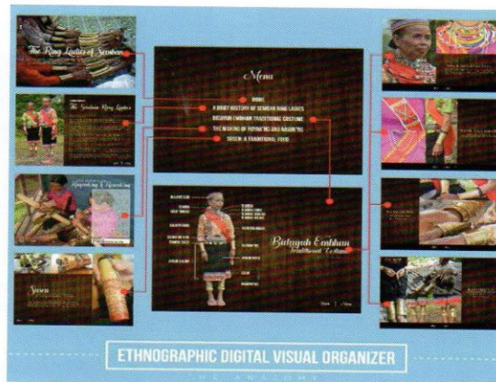
Figure 2: Interactive Infographic