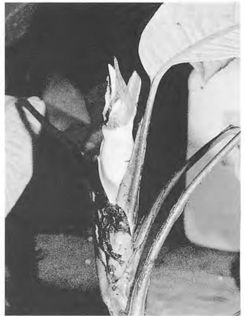
Fig. 10. Schismatoglottis sp. aff. patenti-nervia Engl. at late male anthesis; the spathe limb has deliquesced and is now drying onto the spadix.