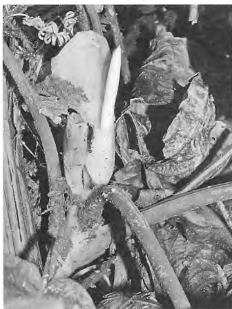
Fig. 11. Schismatoglottis nervosa Ridl. at the post-female/pre-male anthesis interval; note the intact spathe limb beginning to deliquesce.