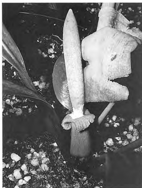
Fig. 28. Schismatoglottis jipomii P. C. Boyce & S. Y. Wong differs from other described members of Tectorata group by the caducous spathe limb falling in a single or only a few pieces.