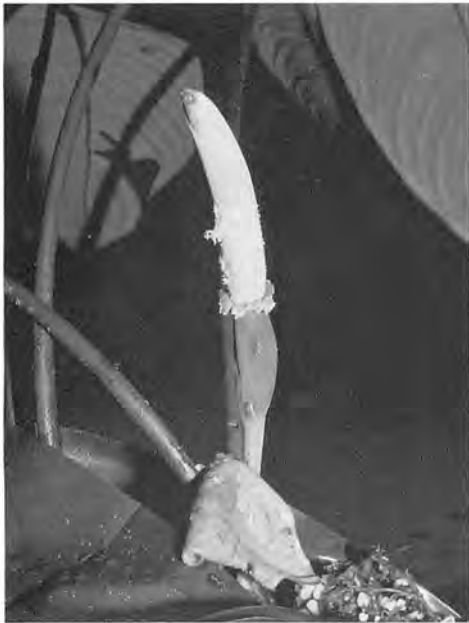
Fig. 15. Schismatoglottis mayoana Bogner & M. Hotta; typical of the Multiflora group by the spathe limb caducous and falling in a single piece.