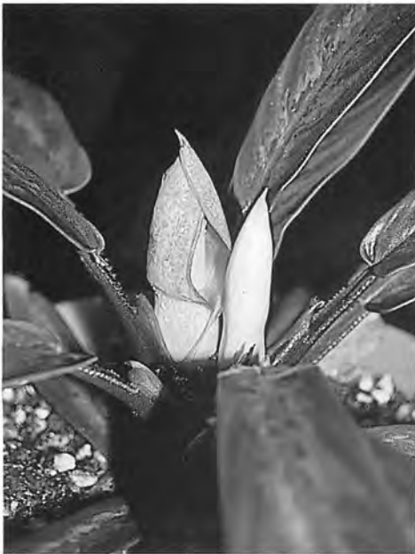
Fig. 3. Schismatoglottis jelandii P. C. Boyce & S. Y. Wong. Left hand inflorescence at end of male anthesis; note beginning to deliquesce.