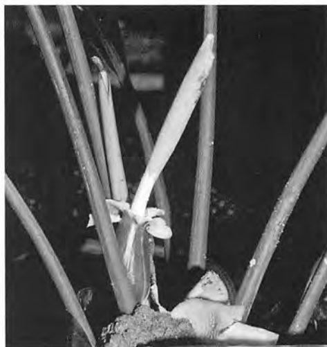
Fig. 29. Schismatoglottis jipomii after the spathe limb was fallen.