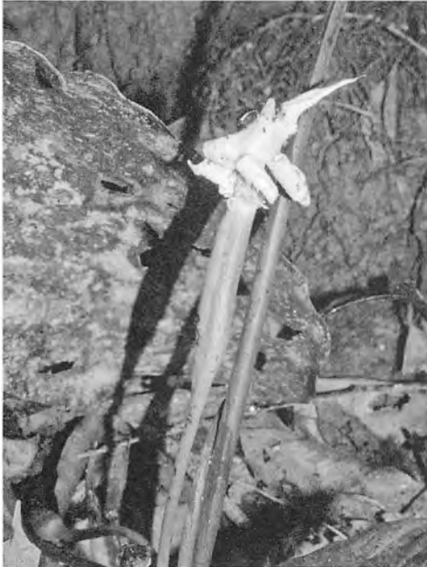
Fig. 20. Schismatoglottis wallichii Hook. f. notable for the spathe limb shedding, splitting into regular pieces that adhere to one another and then contract acropetally before falling as a coherent unit.