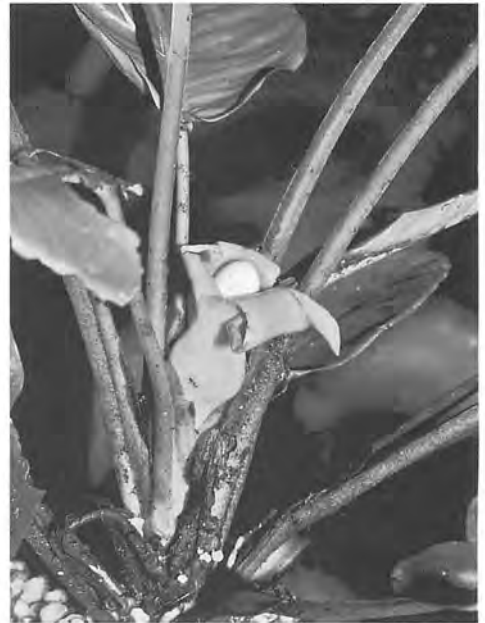
Fig. 5. Schismatoglottis multinervia M. Hotta at the onset of male anthesis; note that the discoloured spathe limb splits longitudinally into two or more strips that reflex to reveal the spadix appendix.