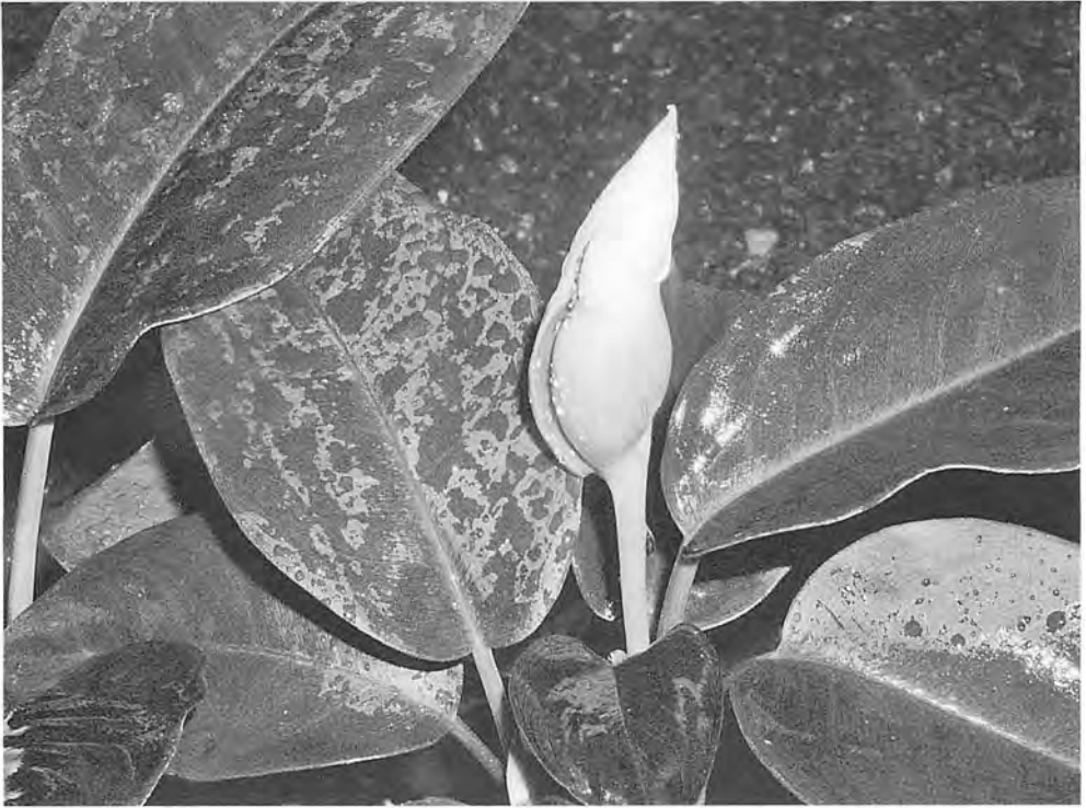
Fig. 14. Schismatoglottis conoidea Engl. at late female anthesis.