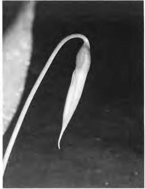
Fig. 24. Schismatoglottis longifolia Ridl. is notable for the spathe limb barely opening and then persistent after anthesis before gradually degrading and falling while still clasping the spent parts of the spadix.

Schismatoglottis motleyana (Schott) Engl. (Fig. 21) and S. wongii A. Hay (Fig. 22) are notable for the spathe shedding in a single piece but not before the adaxial epidermis has begun to slough