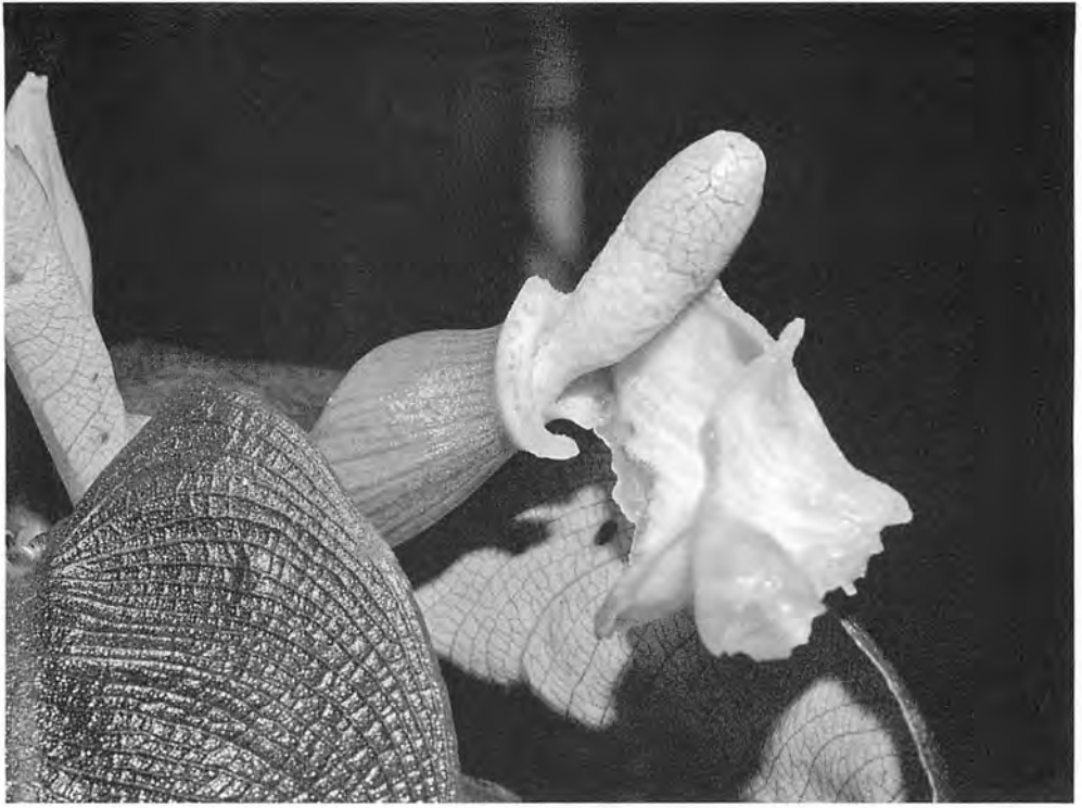
Fig. 8. Schismatoglottis puberulipes Alderw. at late male anthesis; spathe limb now almost fully detached but still intact.