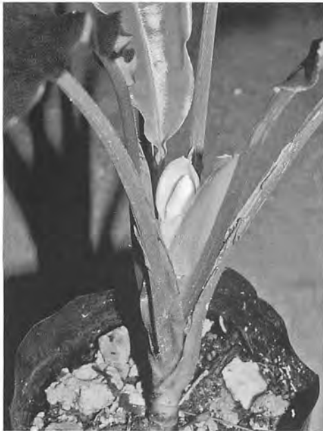
Fig. 9. Schismatoglottis sp. aff. patenti-nervia Engl. at early male anthesis.