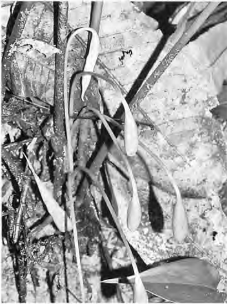
Fig. 25. Schismatoglottis longifolia Ridl. post anthesis with the spathe limb and spent parts of the spadix fallen. Note the nodding inflorescences and infructescences that are diagnostic for this species.

(Schott) Engl. and S. petri A. Hay) allied by a vegetative architecture unique for the genus (foliage leaves alternating with prophylls or cataphylls) and the spathe with only the marginal and distal parts of the spathe limb withering after anthesis with the remainder persisting well into infructescence development (Figs. 26 & 27). Subsequently a further species, S. jipomii P. C. Boyce & S. Y. Wong has been described for the group (Boyce & Wong, 2007) which has the spathe limb caducous at the constriction and falling in a single or only a few pieces (Figs. 28 & 29). The senescence mechanics of S. jipomii thus approach species in the Multiflora Group (q.v.). Most interesting is that the vegetative appearance of the Multiflora and Tectorata Groups is overall very similar although derived from quite different architectural processes.