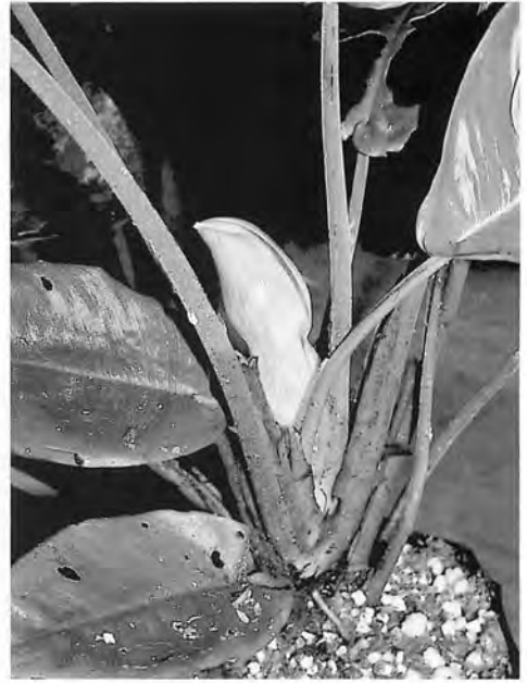
Fig. 4. Schismatoglottis multinervia M. Hotta at female anthesis; note slightly inflated and gaping spathe limb.