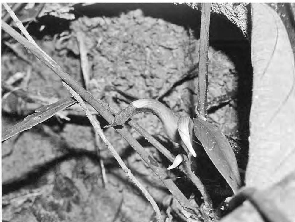
Fig. 27. Schismatoglottis tectorata (Schott) Engl. at late male anthesis with the marginal and distal parts of the spathe limb withering.