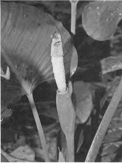
Fig. 19. Schismatoglottis niabensis A. Hay at the end of male anthesis.