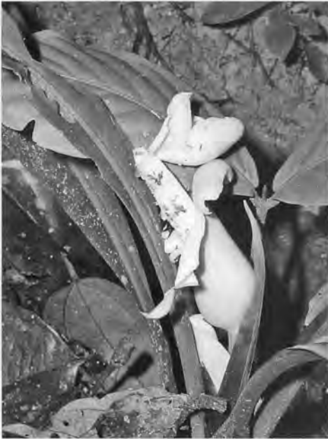
Fig. 17. An atypical species in the Multiflora group, as yet undescribed, in which the inflorescence has the spathe limb irregularly crumbling.

follow the description of spathe mechanics given above, S. multiflora Ridl. (Fig. 16) has a spathe limb persistent into the late stage of anthesis and also employs a series of spathe movements so far unique for the genus and seemingly linked to pollinator management; S. multiflora will be the subject of a forthcoming paper (Lee et al. , in prep.). Another non-typical species is an as yet undescribed species from central Sarawak which has the spathe limb crumbling irregularly (Fig. 17).