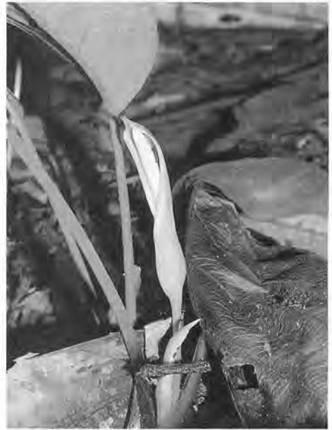
Fig. 26. Schismatoglottis tectorata (Schott) Engl. at late female anthesis.

Additionally, a further three novelties belonging to the Tectorata Group (as yet