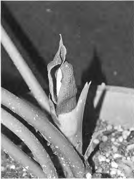
Fig. 23. Schismatoglottis clarae A. Hay is so far unique in the Calyptrata group by the spathe limb deliquescing to form a sticky paste that then dries onto the spadix before being shed.

irregular pieces, while the tissue is still fresh, leaving the male zone and appendix (if present) exposed. However, there are several other senescence types occurring in the Calyptrata Group, which is otherwise defined by mostly hapaxanthic shoots, the petiolar sheath fully attached and usually long compared with the petiole length.