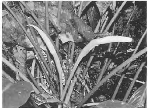
Fig. 16. Schismatoglottis multiflora Ridl. has a spathe limb persistent into the late stage of anthesis (left hand inflorescence is at the post-female/pre-male anthesis interval).