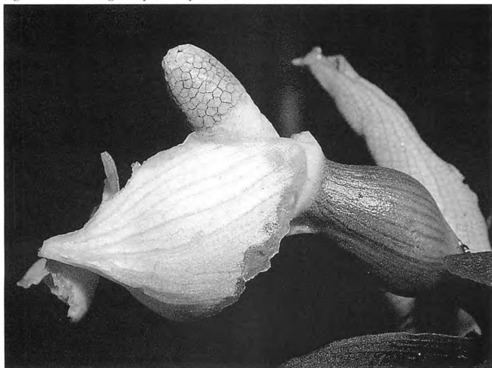
Fig. 7. Schismatoglottis puberulipes Alderw. at early male anthesis; note the abscission just beginning.