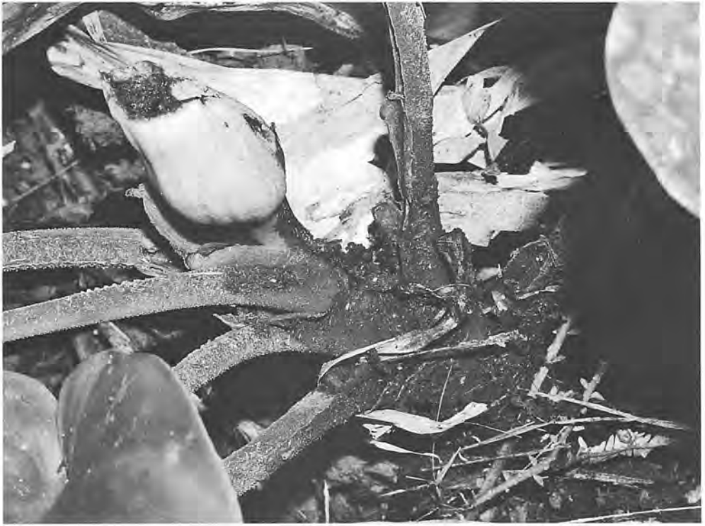
Fig. 1. Schismatoglottis asperata Engl. inflorescence at early fruiting stage showing the open persistent lower spathe.

erect shoots with lorate leaf laminae borne on broadly winged petioles, but also by the inflorescences carried deep within the shoot tips (Fig. 9). Female flower receptivity is marked by the spathe inflating and the spathe limb gaping slightly. During male anthesis the spathe limb opens somewhat further before senescing in a way similar to that of S. clarae A. Hay (Calyptrata Group) with the spathe limb liquefying. However, species in the patentinervia complex differ from S. clarae by the liquefied limb subsequently drying onto the spadix and shedding when the post-anthetic upper spadix is shed (Fig. 10).