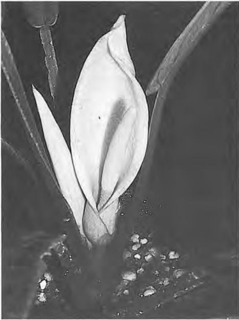
Fig. 2. Schismatoglottis jelandii P. C. Boyce & S. Y. Wong. Right hand inflorescence at early male anthesis; note wide open spathe limb.