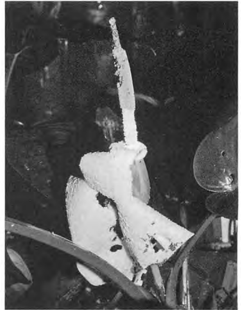
Fig. 22. Schismatoglottis wongii A. Hay from SE Sabah resembles S. motleyana (Schott) Engl. in its spathe mechanics.