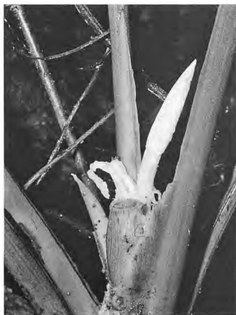
Fig. 12. Schismatoglottis nervosa Ridl. at the post-male anthesis; spathe limb completely melted and shed.