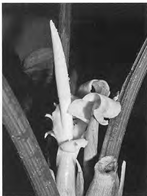
Fig. 13. Schismatoglottis sp. aff. nervosa Ridl. from granites; note the spathe limb breaking into irregular pieces as it is shed.

notably thick and glossy (Fig. 14) as opposed to the rather spongy texture of species closely allied to S. asperata .