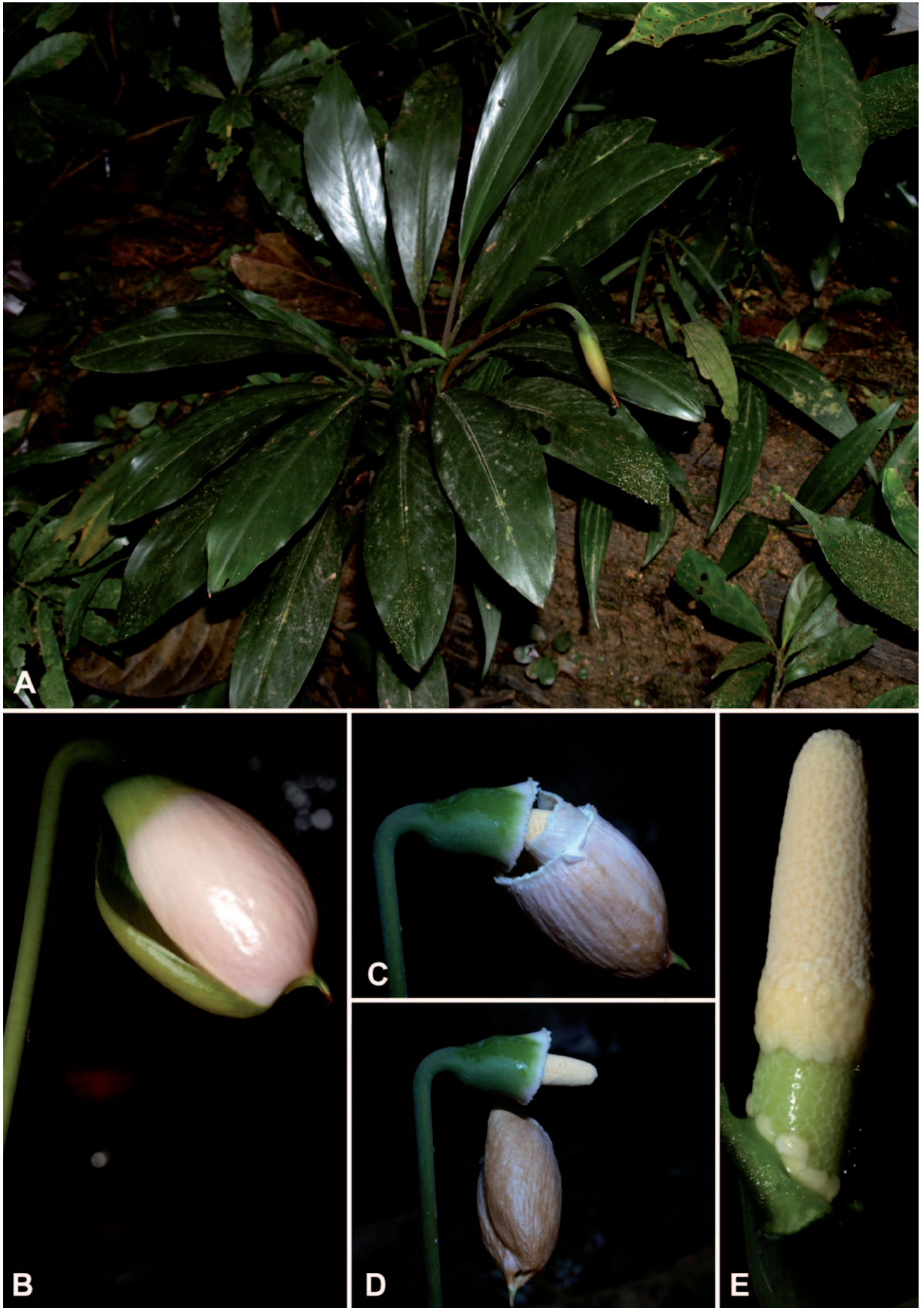
Fig. 2. Piptospatha burbidgei – A: flowering plant in habitat, on shales, Mulu N. P., N. Sarawak; B: inflorescence at pistillate anthesis; C: inflorescence at onset of staminate anthesis. Note that the spathe limb has begun to senesce and has partly separated from the lower, persistent spathe; D: inflorescence towards end of staminate anthesis; E: spadix (spathe artificially removed) at pistillate anthesis.