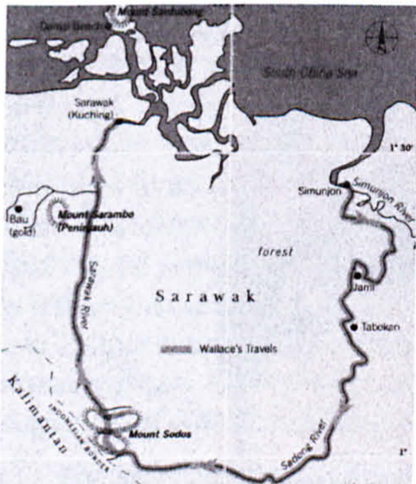
FIGURE 5: Wallace's route in Sarawak.