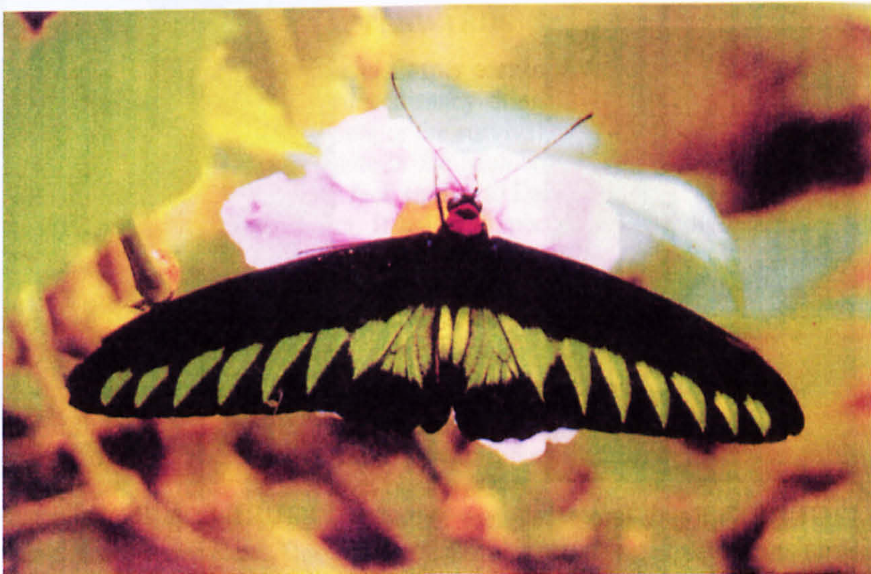
FIGURE 3: Rajah Brooke's birdwing butterfly.