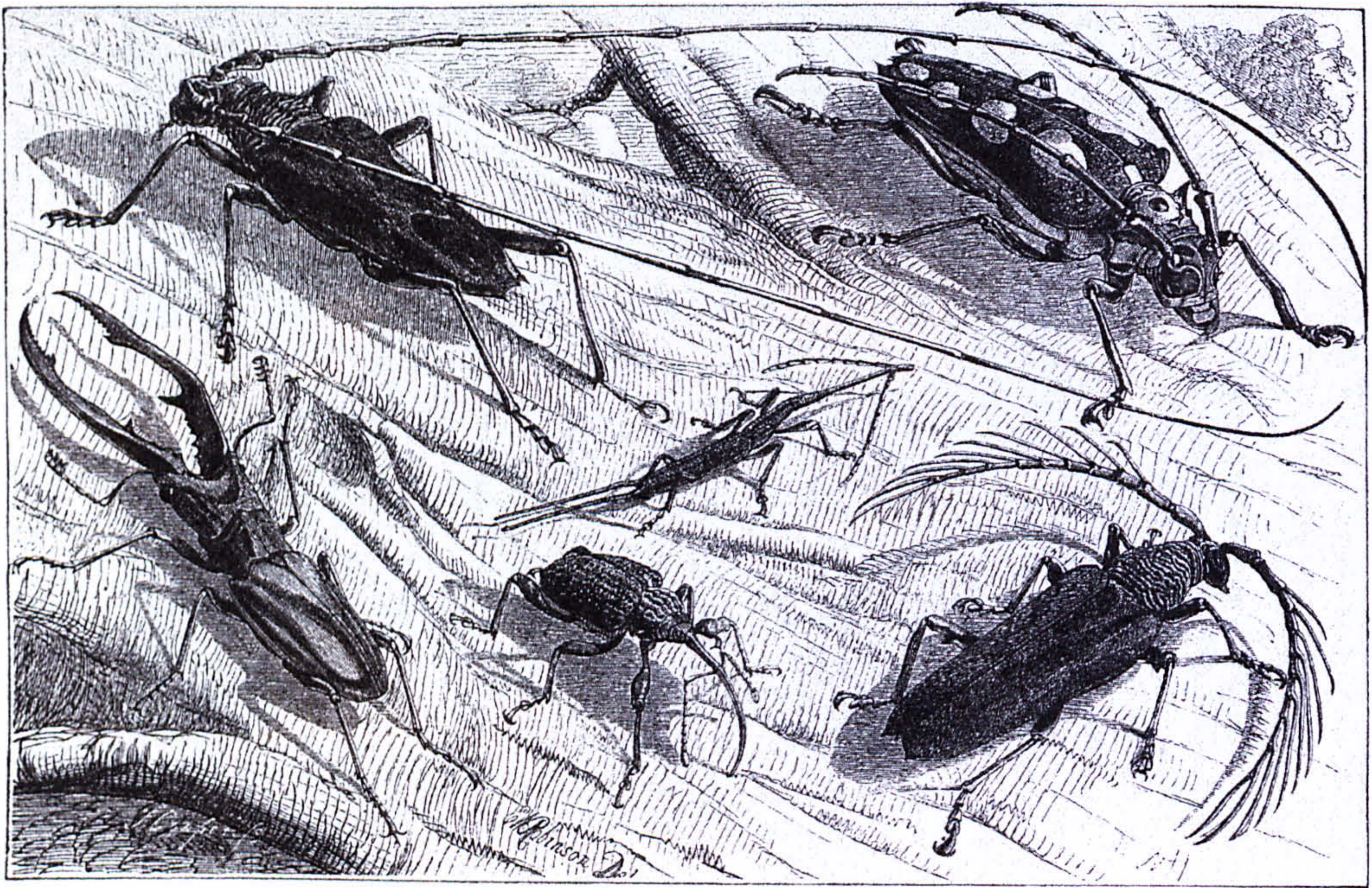
FIGURE 4: Beetles collected by Wallace at Simunjon.