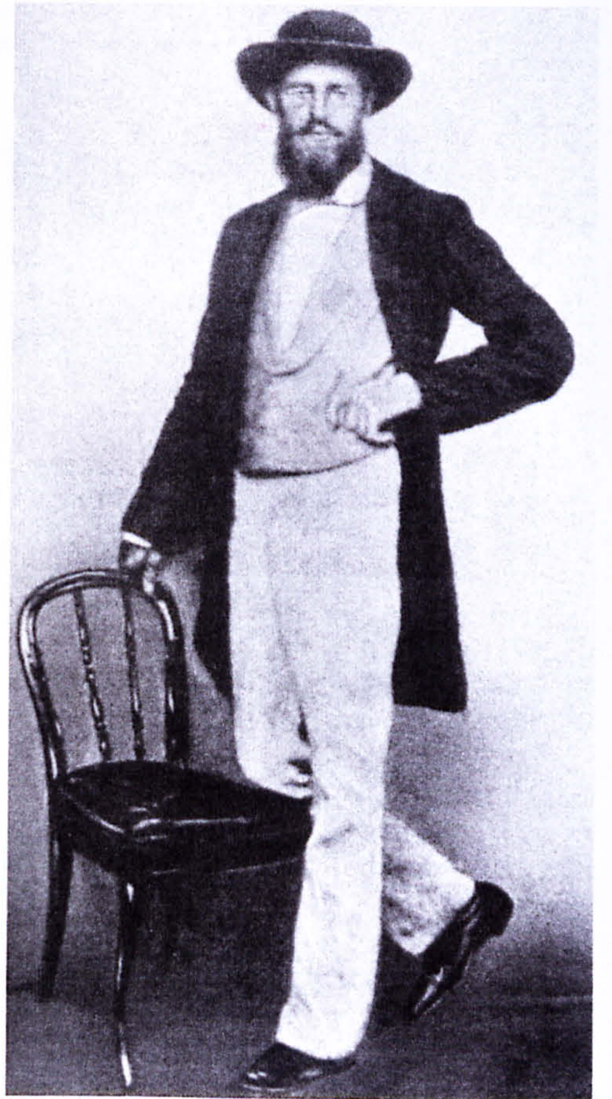
FIGURE 8: A. R. Wallace, Singapore, 1862.