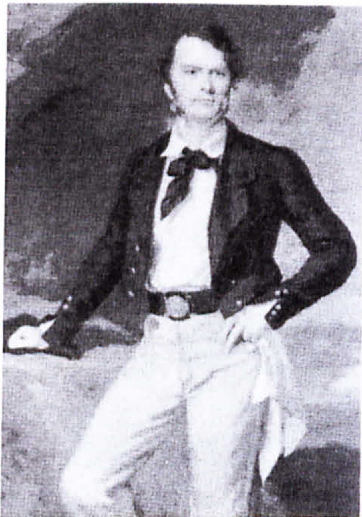
FIGURE 7: Rajah James Brooke.