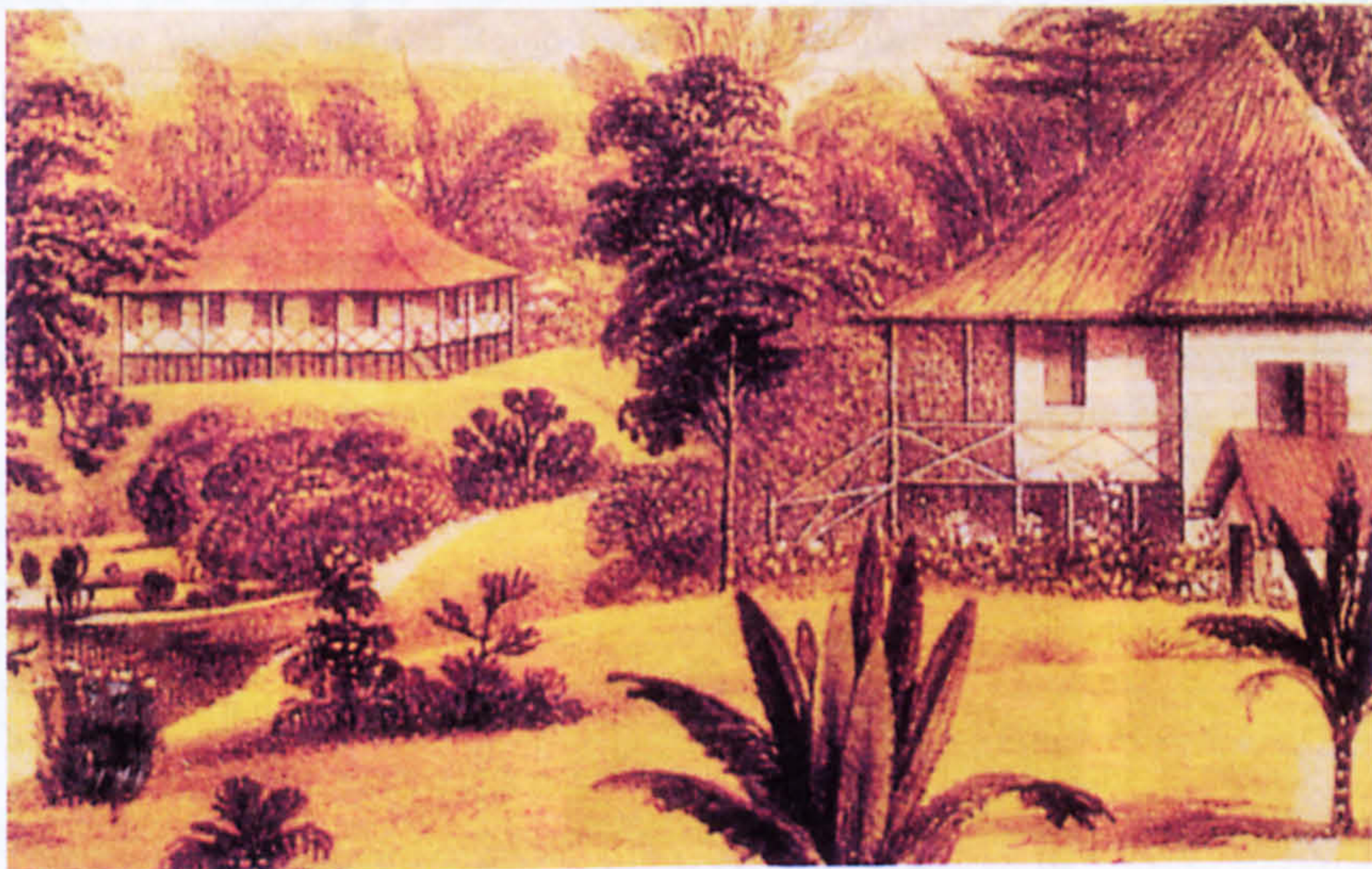
FIGURE 2: Rajah Brooke's bungalow, where A.R. Wallace resided.