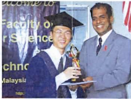
UNIMAS Convocation 05

UNIMAS will be having the 9th convocation on the 13th -14th of August 2005. Faculty of Computer Science and Information Technology is scheduled on the first day second session at 2.00pm with 69 graduates. The ceremony will include 9 students from Information System program, Network Computing with 31 students, Multimedia Computing with 14 students, and Software Engineering with 15 students. Computational Science was not offered at that particular duration.