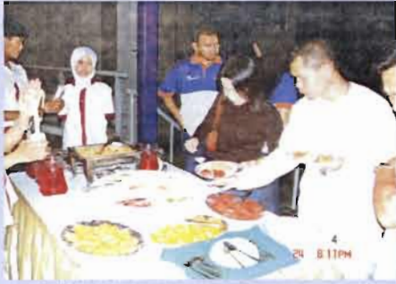
PERTEKMA DINNER AT NEW CAMPUS

In conjunction with moving to new campus, PERTEKMA held a house warming dinner party at the new FCSIT Campus on 24 March 2006. The objectives of the dinner party were to celebrate the use of the new campus and also as a token of appreciation for the committee members of PERTEKMA 05/06.