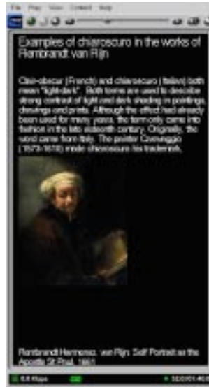
Figure 5: Example SMIL presentation about the use of chiaroscuro in the works of Rembrandt.

The example given in this section aimed at providing an intuitive notion of the possibilities and limitations of the current Semantic Web infrastructure. In the following section, we provide a more systematic discussion of the open research questions and the potential contribution of the hypermedia research community in resolving them.