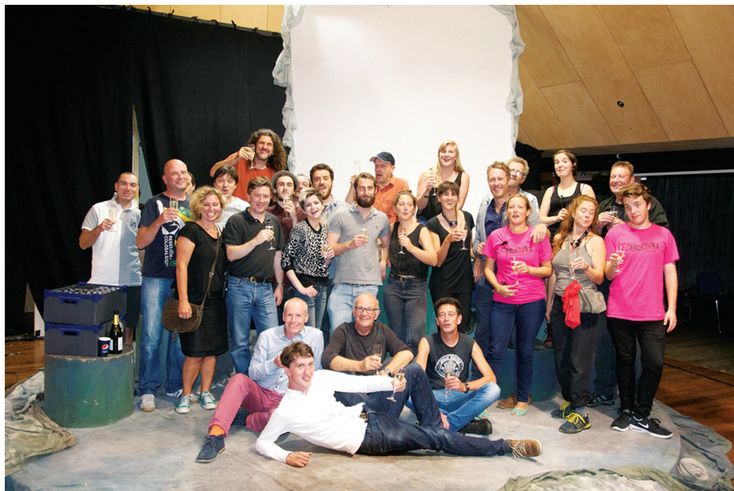
Figure 7. The team, the “luvvies and techies” from the Miracle Theatre Company and Vconnect project, enjoying brief celebration before tearing down the set.

automatically against a rigid time line. Those who really knew theatre, the luvvies, gently explained that would not be the case.