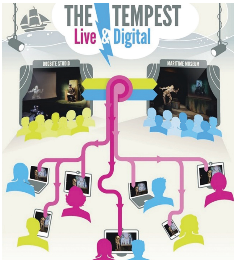
Figure 2. Schematic of the performance challenge; two performance spaces and an audience at home.