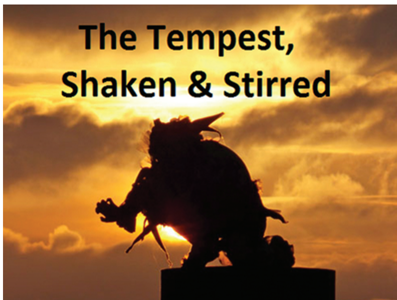
Figure 1. Catherine Lake (as Ariel) photographed during the touring performance of The Tempest by Miracle Theatre Company. This image was used to promote the distributed performance that took place toward the end of the touring run.

Ariel's magical qualities were also emphasized through the use of a double and well-timed action that made it seem that as Ariel disappeared from the screen in one location,