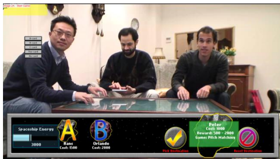
Figure 1: Screenshot from the Family Game prototype

One such use case, ‘Family Game’, investigated how a board game could be shared between multiple people at remote locations. Participants used the TV screen both for social communication and playing the game and their activity was captured by multiple microphones and cameras. Playing cards embedded with RFID tags were used to control chance aspects of the game, while the participants used their own bodies (via a Microsoft Kinect 3D motion sensor) as the interface for completing a series of activities. The game was intrinsically cooperative: players in different locations had to collaborate to achieve a common goal – for example collectively steering a ship through an asteroid field – by taking different individual roles which required communication. Figure 1 shows an example screenshot from the game.