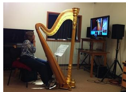
Figure 2: The Music Tuition prototype in action

Another important use case considered the teaching of skills which require embodied learning, such as playing a musical instrument. Institutions worldwide are beginning to use videoconferencing to bring scarce teaching talent to more and more pupils. The use of multiple cameras and dynamic composition has the potential to significantly improve the experience of a remote lesson conducted through a video conferencing system.