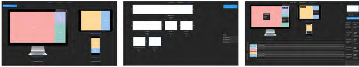
Figure 2. Pre-production workflow (from left to right): layout design, chapter creation, timeline editing

application is the part of the system that a production team would use to create these experiences. The authoring application is a browser-based application, with which a producer can assemble an experience in a step-by-step fashion. Roughly speaking, this process is comprised of designing the layout , creating masters , defining chapters and designing the timeline (see Figure 2). In the layout design phase, the user can either load a predefined layout, e.g. from a previously created experience, or add screens manually and segment them into regions using the mouse. The master creation is concerned with the creation of so-called masters . This is akin to the concept of master-slides in a presentation program like PowerPoint. So for instance, if the user wants certain objects to be shown all throughout the experience, like for instance the broadcaster logo and the lap-counter during a motorcycle race, they would create a master layout containing DMAPp Components rendering these objects. This avoids the need to redefine these components for every chapter of the presentation. The utility of this approach will become apparent in the next paragraph.