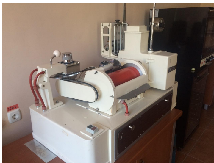
Fig. 2. Extensograph «Brabender»

Extensograph also gives a possibility to detect the additive influence on the flour that allows receive the reliable parameters of the flour rheological parameters and correct rheological optimum depending on the set tasks.