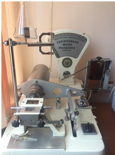
Fig. 1. Farinograph “Brabender”

«Brabender» farinograph, used for the study of structural-mechanical properties of the dough at mixing, is presented on the Fig. 1 .