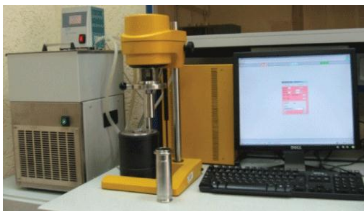
Fig. 3. Rotary viscosimeter Rheotest RN 4.1

The study of rheological characteristics of dough ( Fig. 3 ) (effective viscosity and shift tension) was carried out on the rotary viscosimeter Rheotest RN 4.1., made by «RheoTest Messgerate Medingen GmbH», Germany.