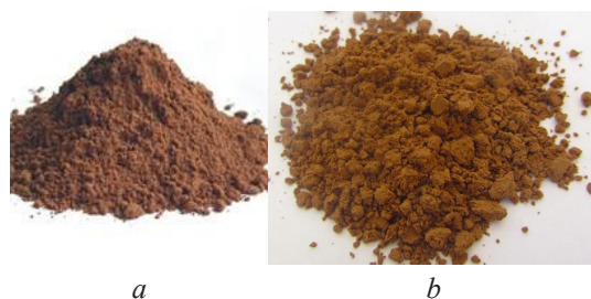
Fig. 1. Grape seeds powder: a – GSP; b – DGSF

Powders were obtained under industrial conditions. At first grape seeds were separated from pomace, dried at a room temperature and subjected to the thorough purification (separation). Then GSP (grape seed powder) was obtained by superfine grinded. Another powder type DGSF (defatted grape seed flour) was obtained by extraction of oil of grape seeds by cold pressing. Pomace, created after grape seed pressing was superfine grinded up to flour. This powder type is a commercial product at the Ukrainian trade market, realized as a trademark OleoVita (Orion, Ukraine) ( Fig. 1 ).