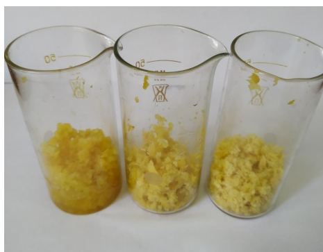
Fig. 3. Recycling products of quince Japanese (solid part) after cyclic freezing-centrifuging (from the left to the right – after the first cycle, after the second cycle, after the third cycle)

The solid part of quince Japanese after the third cycle of freezing-centrifuging is a liquid without suspended particles. These changes are explained by redistribution of dry substances and moisture in the studied specimens.