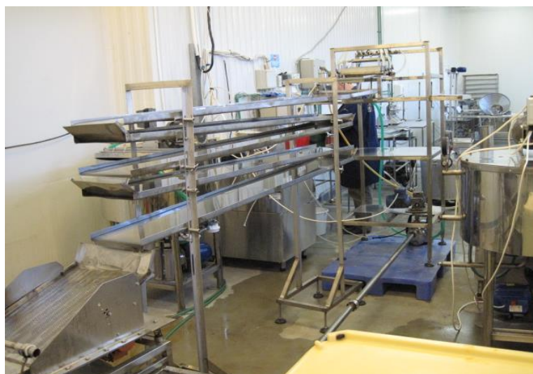
Fig. 2. Photo image of a production line for getting capsulated and granulated products with the capsule diameter d=(1,0-10,0)\cdot 10^{-3} m, power 100 kg/hour

The experimental studies were conducted in the laboratory of rheological studies of Kharkiv state university of food and trade (Ukraine) and under production conditions of “Capsular” company (Ukraine).