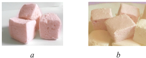
Fig. 1. Samples of the new marshmallow types with natural anthocyanin dyes: a – extract of krias-powder from Sudanese rose; b – extract of krias-powder from black chokeberry