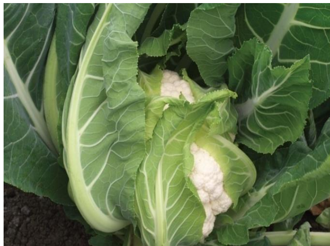
Fig. 2. Cauliflower hybrid Kul F 1

Kul F 1 ( Fig. 2 ). The vegetation period lasts 60–65 days. The hybrid has a good snow-white head. The good self-opening is typical. The hybrid has high homogeneity level in ripening. A plant is compact. It is fit for being realized fresh. It is recommended for planting and collecting at the beginning of summer and also by a conveyer at autumn harvesting [10].