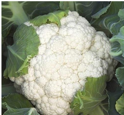
Fig. 3. Cauliflower hybrid Opal F 1

Opal F 1 ( Fig. 3 ). It is intended for planting in hothouses and also for getting extremely early products in open soil under a perforated film and argofiber. It has no competitors in ripening terms (within 55 days for the moment of planting seedlings). Racemes are solid, compact, snow-white, with a mass from 0,6 to 1,5 kg. The recommended planting density – 35–40 thousand plants for 1 he [10].