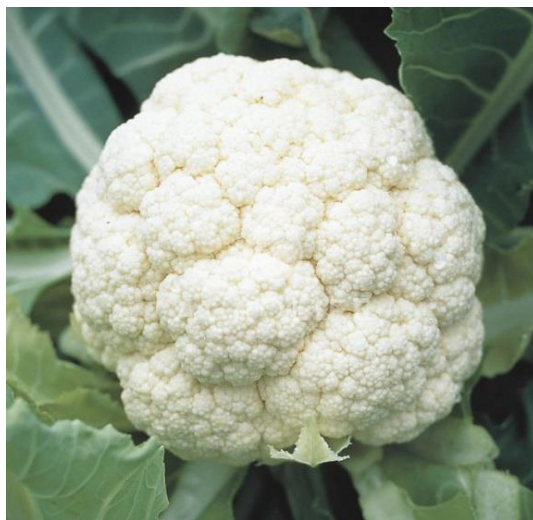
Fig. 1. Cauliflower hybrid Livingston F 1

Livingston F 1 ( Fig. 1 ). The vegetation period counts 55–60 days. The hybrid has a snowwhite head and the high homogeneity level in ripening. A plant is compact with the strong root system. It is fit for being realized fresh. It is recommended for planting and collecting at the beginning of summer and also by a conveyer at autumn harvesting [10].