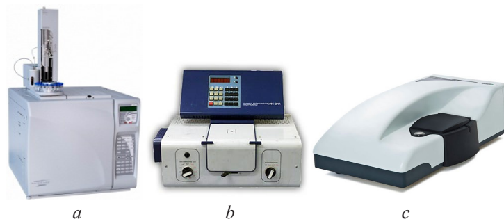
Fig. 2. Equipment: a – Crystal-2000M, b – Photocolorimeter CPC-2MP, c – Laser spectrometer Zeta Sizer Nano

The composition of volatile admixtures in marsh distillates was determined by the gas chromatographic method on the gas chromatograph Crystal-2000M CSC SCB “Chromatech”, Joshkar-Ola, Russia, Fig. 2, a .