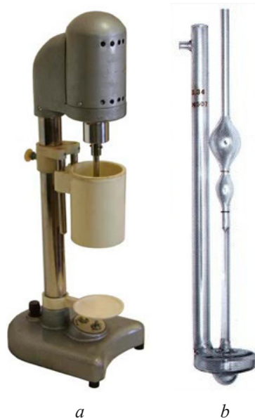
Fig. 1. The types of equipment, used during the study: a – micro-shredder of tissues RT-1; b – viscosimeter VTL-2 with capillary diameter 0,56 in water thermostat

After that the reactive mixture was filtered and kinematic coefficient of filtrate viscosity was found by capillary viscosimeter VTL-2 (“Oilchemigroup, LTD, laboratory equipment, Kyiv city, Ukraine) with capillary diameter 0,56 in water thermostat ( Fig. 1, b ) [12].