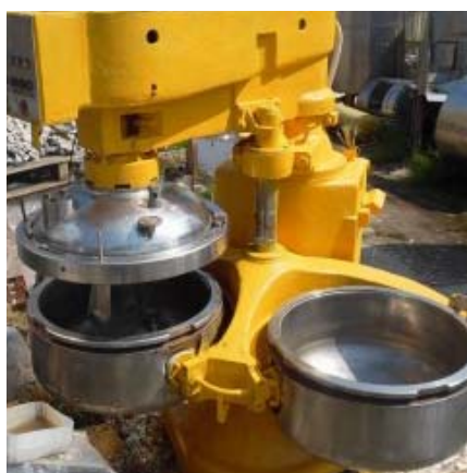
Fig. 1. Cooper of melting cheese V2-OPN 1200 kg/hour

Components of the mixture for melting were preliminarily prepared, according to requirements of technological instructions at processed cheeses production [20]. The mixture was melt at the temperature 80–82 °C (Fig. 1).