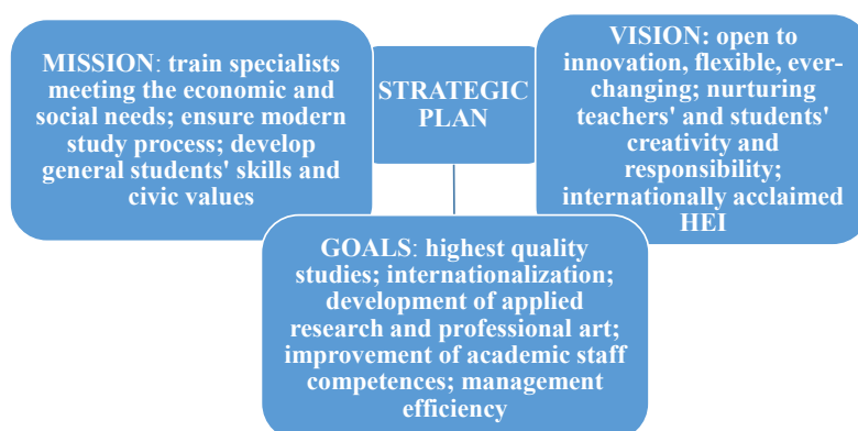
Fig. 1. Elements of the Strategic Plan of Vilnius kolegija/UAS (composed by authors)

Many aspects, which require changes and integrated solutions, prevail in the elements of Vilnius kolegija/UAS Strategic Plan until 2020 (Fig. 1). From the perspective of KM, knowledge organization, which evaluates and acquires the missing knowledge in order to pursue the necessary competences to maintain competitive advantage, is being developed. While analyzing the Institution's vision and mission, it could be observed, that most of the statements reflect the general organization's competences, and this means, that the vision and mission seek to bring about the realization of employees' knowledge and competences in the performance of the Institution's activities. Therefore, investing into employees' knowledge becomes a key prerequisite for the Strategic Plan of Vilnius kolegija/UAS .