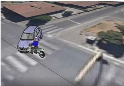
Fig. 1. Case-study crash conditions.

The results of the simulations showed that a late intervention of the PCB with deceleration of 0.3 g could have produced an impact speed reduction of 3.2 km/h. Assuming an automatic deceleration of 0.5 g, impact speed reduction could have been 5.4 km/h. Similar effects were obtained with early intervention of the PCB system at low deceleration, whereas the combination of early intervention and higher deceleration could have produced an impact speed reduction of 8.6 km/h (Table I).