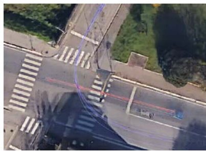
Fig. 2. Real-world trajectory overlap.