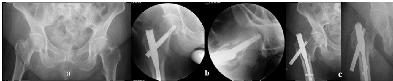
Figure 2 - Preoperative images of a 81-year-old patient with a 31.A2 trochanteric fracture (a) treated by PFNa (b). One month after surgery the patient complained pain and was unable to walk: radiologic evidence of cut-out (c).

tial weight-bearing before discharge: the remainders were not able to apply weight-bearing on the operated leg (10 subjects with 31.A2 fractures), or were not allowed to for an associated spinal fracture or other concomitant clinical issues (3 patients with 31.A2 fractures, 1 with 31.A1 fracture).