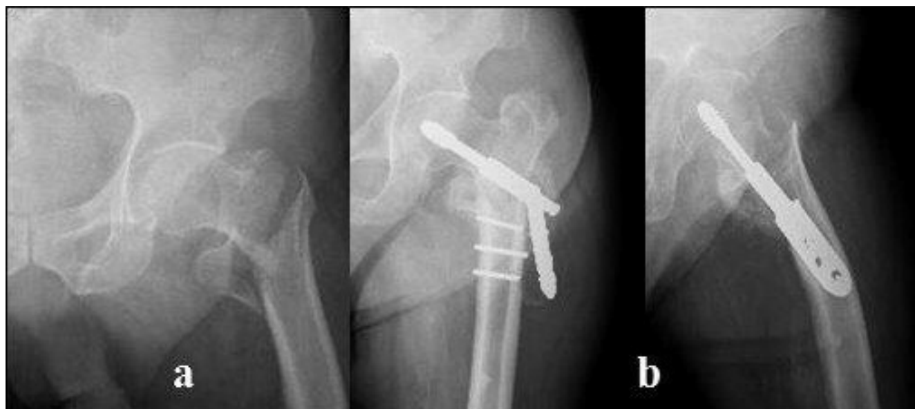
Figure 3 - Preoperative X-rays of a 80-year-old patient with a 31.A2 trochanteric fracture treated by DHS (a). Three months after surgery: screws breakage and varus deformity (b).

At the 3-month follow-up visit, in the group A 58 patients (81.7%) were able to walk independently without crutches or at least with one cane; the remainders (all with 31.A2 fractures) were able to perform an almost normal gait within 6 months post-operatively. At the same interval, in the group B 45 patients (67.2%) were able to walk independently without crutches or at least with one cane: all the others (31.A2 fractures) reached the same result at 6 months post-operatively,