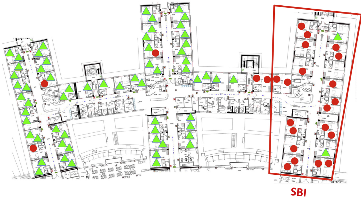
Figure 1. Results of the point prevalence survey for rectal colonization of carbapenemase-producing Enterobacteriaceae performed in January 2016: spatial distribution of colonized (red dot) and non-colonized (green triangle) patients. SBI, severe brain injuries ward.

population of patients admitted to a large LTACRF was not homogeneous in terms of risk for CRE colonization and infection, and found that patients admitted to the SBI ward were at much higher risk, with KPC-KP carriage rates that could reach 90%. This condition was apparently related to both a higher carriage rate at admission and a higher risk for cross-contamination after admission. Considering that patients from SBI wards are characterized by longer LOS and are typically exposed to a higher intensity of care, often including mechanical ventilation, these findings are in overall agreement with previous findings that identified mechanical ventilation and length of stay as two independent risk factors associated with CRE colonization in LTACRFs [12], and a number of features of the population of patients colonized/infected by CRE such as older age, high rates of comorbidities (including renal disease, advanced stage wounds and respiratory failure), and need for indwelling devices (including central venous catheters and tracheostomies) [17].