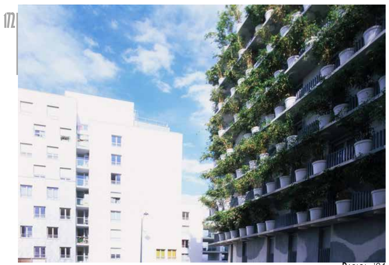
Parigi, '01 Copenaghen, '13