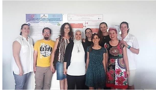
Figure 2 The group of PARIMUN's students involved in the 2016 edition of Expo Thesis