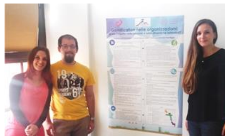
Figures 3 and 4 Students and organizational representatives involved in the 2016 edition of Expo Thesis