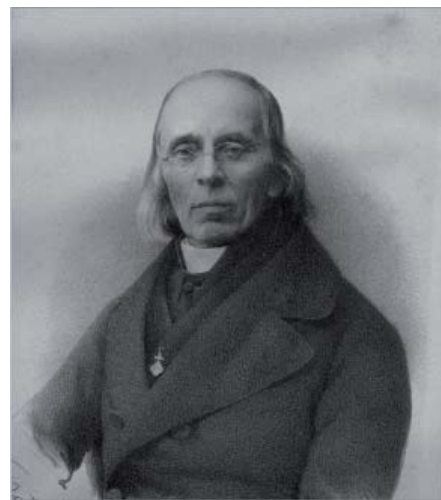
Figure 1b. Francesco Zantedeschi.

It is interesting to understand what Zantedeschi really did, and why he is credited. Information was sought in the original papers, which are mostly in Italian and hence of difficult access to our international community.