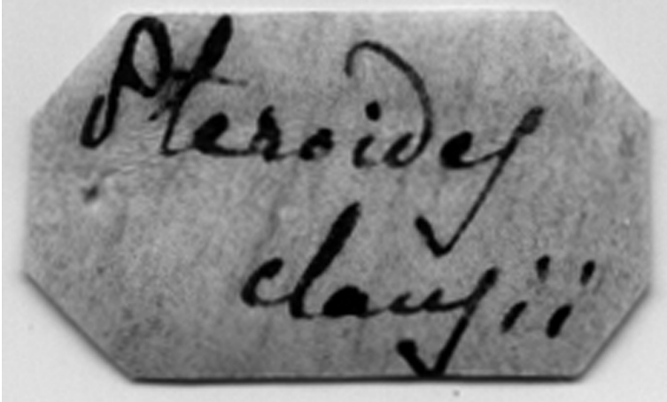
Fig. 1 - Example of the handwritten parchment label, tied to the specimens studied by S. Richiardi. Fig. 1 - Esempio di etichetta di pergamena scritta a mano, legata agli esemplari studiati da S. Richiardi.

belonging to that order. All the samples are recognizable from a parchment label handwritten by Richiardi tied by string to the pennatulaceans (Fig. 1).