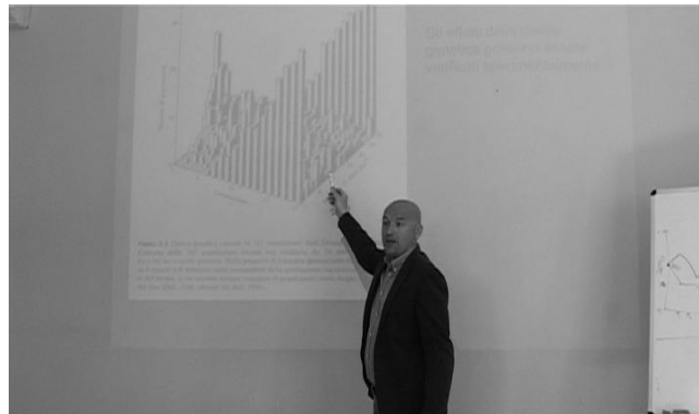
figure 1 - "Sparring" model (University of Siena source)

From the "Genetics of populations and conservationist" course of degree in Biodiversity and Nature Conservation, "Genetic drift" lecture was chosen. From this educational content two concepts have been extracted, which were used in experimentation: "Biodiversity and Nature Conservation" and "Genetic drift and natural selection". For each of the two concepts, two prototype video content have been developed, using both the model "Sparring" (figure 1) and the "USiena" model (figure 2).