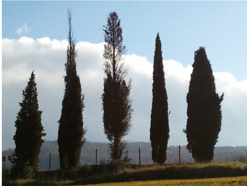
Fig. 2. Cupressus sempervirens trees with large crown dieback by Seiridium cardinale , agent of cypress canker Fig. 2. Piante di Cupressus sempervirens con vistosi disseccamenti della chioma da Seiridium cardinale , agente di cancro corticale.

Cupressaceae , with a preference for the genus Cupressus . Like similar bark beetles, it attacks its host in two distinct phases.