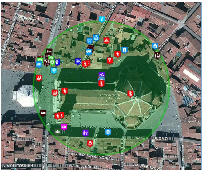
Figure 2: ServiceMap results performing the visual query on Km4City knowledge base.

time makes the implementation of web and mobile Apps more independent from the data of the smart city. For example, traditionally a certain API call adopted in mobile App can request a list of services' types in an area. If the developer decides to change the list of requested service type, the mobile App has to be rebuilt. On the contrary, adopting an API call based on QueryID, the developer can simply change the query associated with the QueryID without rebuilding the application. For example, to get the HTML, the URL represents the same query stored with a QueryID http://servicemap.disit.org/WebAppGrafo/api/v1/?queryId=9e5662a352d90ad4bc77690277a371ab&format=html (see Figure 2). In Sii-Mobility, the developers may use the ServiceMap tool to compose visually some geographical and textual queries, and from them to request the sending of an email containing the calls that can be performed for obtaining the same resulting data in JSON and/or web page in HTML. In Figure 2, the ServiceMap at work is presented.