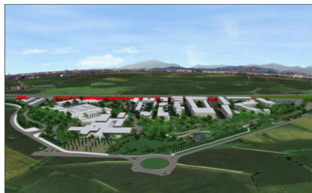
Fig. 1 Lombardia: APEA Kilometro Rosso, Bergamo.

In December 2009, Tuscany, which is one of the Italian Regions that is most engaged with the Industrial Ecology (IE) approach as a policy tool, launched a new initiative that sparked an innovative policy stream based