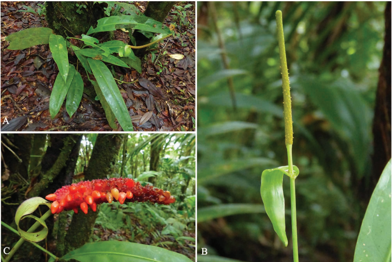
FIGURE 5. Anthurium chucantiense at the type locality. A. In its habitat. B. Flowering spadix. C. Infructescence spadix.

narrowly long-acuminate at apex, attenuate at base, medium-dark green and semiglossy above, moderately paler and matte below, drying dark brown above, moderately paler and yellow-brown below; midrib prominently raised, narrowly rounded and slightly paler above, V-shaped and paler below, drying concolorous above, reddish-brown below; primary lateral veins up to 15 pairs, arising at 55–75° angle, obscure and weakly etched above, weakly raised below, concolorous on both surfaces, drying weakly raised and slightly darker below; collective veins arising from one of the lowermost primary lateral veins. Inflorescence erect; peduncle terete, 26.5–54 cm long, 2.0 mm diam.; spathe green, medium green, decurrent into peduncle 0.2–2.0 cm, linear-lanceolate, 3.0–8.0 × 1.0–1.9 cm, spreading-reflexed and recurled, abruptly acuminate at apex; spadix erect, cylindrical, 5.7–12.5 cm long, 2.0–4.0 mm in diam., yellowish green and matte when stamens begin to emerge, becoming pale orange lower down, stipitate; stipe green, 2–19 mm long, 1–2 mm in diam. when dried; flowers 4 visible in the principal spiral, 3–6 in the alternate spiral; stamens slightly exerted, filaments translucent; anthers yellowish. Infructescence pendent, spathe green with reddish margins, spadix 8.5 cm long, 1.3 cm diam., ca. 6.5 times longer than wide, tepals brick-red; berries narrowly ovoid, orange-red, ca. 1 cm long when fresh, 0.7–0.9 cm long when dried, bluntly pointed at apex; seeds 2.