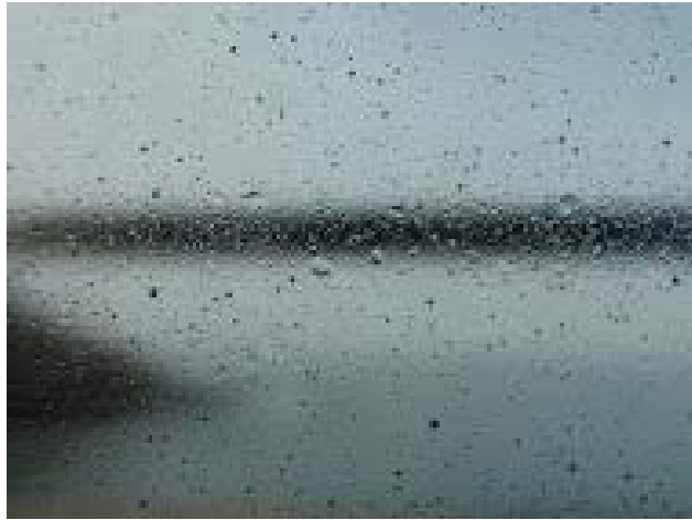
2 - Horizon

But in Ulysses , Buck Mulligan regards water with contempt compared to tea: “When I makes tea I makes tea, as old mother Grogan said. And when I makes water I makes water”. To ‘make water’, of course, also means ‘to urinate’. And for Stephen Dedalus the sea is unromantically “snotgreen, bluesilver, rust”. Yet he stands on “the top of the Howth tram alone crying to the rain: Naked women! naked women!”. And water retains its erotic charge for Molly Bloom, daydreaming of men and masturbating in her dark bed after her beauty sleep, thinking “that rain was lovely”.