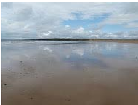
1 - Achill

It's a foggy morning in Ireland as I begin this essay. The newspapers report weather warnings from the Meteorological Service as though fog were not an essential ingredient of winter here, not to mention part of our mythology and, some say, our personalities. The rose bushes outside my window, the bony birch and the watery hazel, the leaves on the lawn, the naked beeches are all shades of old gold. The ground is damp and soft underfoot because we have just come out of a prolonged period of gales and heavy rain. Everything outside my front door feels slightly damp. Even the air is, as we say, 'close'. It is a soft morning in that age old Irish euphemism.