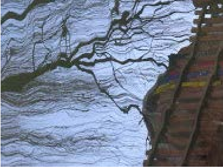
4 - Camden Town

eyed about it. Wind, tide and wave, tempest and thunderstorm, river and lake and ocean – water is above all a force of nature to be lived with.