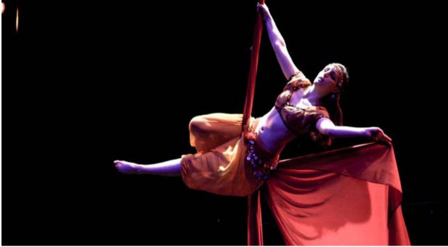
2 - Photo by Paola Nogueras