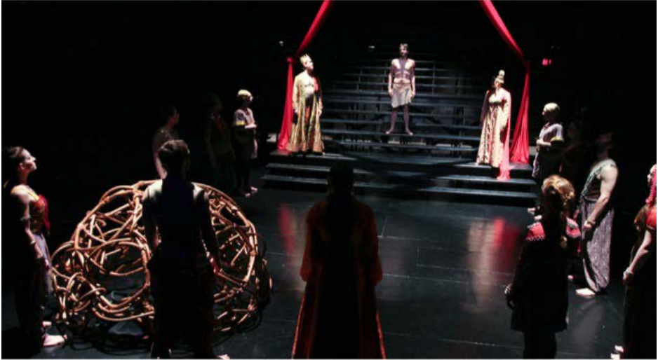
4 - Photo by Paola Noguerras