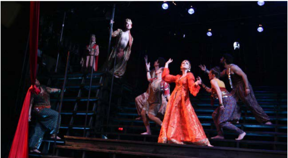
5 - Photo by Paola Noguerras