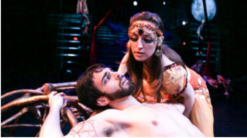
1 - Photo by Paola Noguerras

The initial exchanges between Salomé and Iokanaan are fraught with the tension of the collision of the spiritual and the sexual. Salomé identifies something that she would like to spend her sexual currency on, and yet, the Prophet is chaste and focused on the mystical above the carnal. Iokanaan speaks a vertical language that connects heaven and earth, a language that Salomé is attracted to. But the only language she has been taught is the horizontal language of earthly desires involving politics, of state and of gender. Salomé proceeds to try to possess this new horizon she experiences in Iokanaan through seduction, her singular commodity. In Dolan's language, Iokanaan is her "affectional preference". In this choice, Salomé's sexuality in the play represents her agency as she attempts to transcend a gender regime that has dominated her.