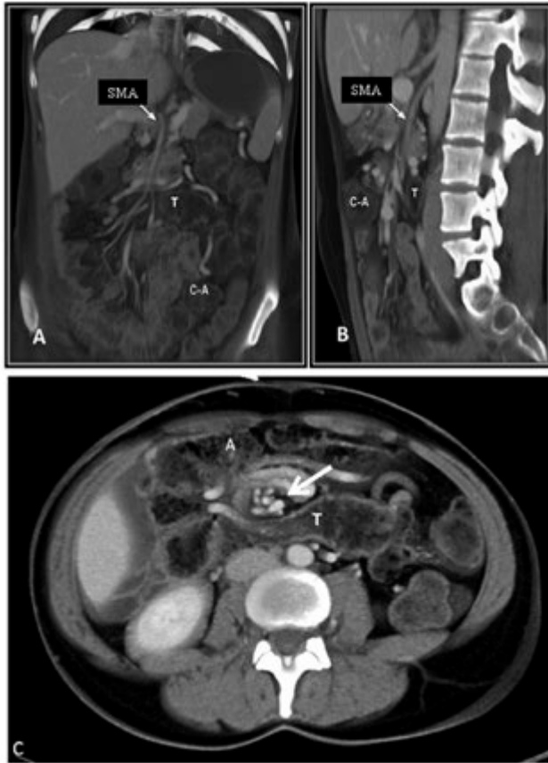
Figure 2 – Abdominal contrast enhanced computer tomography (CT) with three-dimensional (3D) volume rendering (VR) reconstruction confirmed intestinal malrotation. A, B: 3D coronal ( A ) and sagittal ( B ) VR images show left side localization of right colon, and reverse rotation expressed by transverse colon (T) running posterior to the superior mesentery artery (SMA, arrow) and to the caecum and ascending colon (C-A). C: Axial 3D VR of contrast enhanced abdominal CT. Transverse colon (T) is recognizable posteriorly to SMA and to ascending colon (A). Superior mesenteric vein shows a whirling pattern (“barber pole sign”) (arrow).